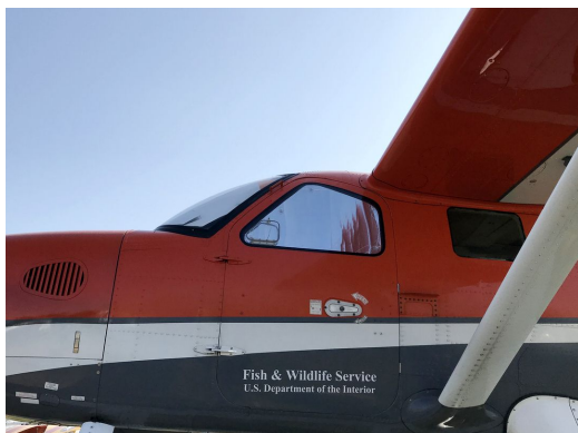
Quest Kodiak Cockpit HeatShields

Cockpit Heatshields are interior sunshades for the aircraft's cockpit. The product is a unique composite of closed-cell foam with a silver mylar finish. The semi-rigid design is stiff enough to stand inside the window framing. The set folds up flat and is easily stored in the included storage sleeve. Some designs may require velcro and suction cups. A Heatshield is an excellent short-term remedy for cockpit overheating, but an external fabric cover is more effective for long-term protection.