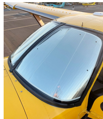
Quest Aircraft Kodiak Cockpit Heatshields