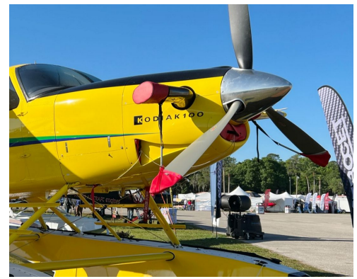
Quest Kodiak Prop Tie, Exhaust Covers, Intake Plug