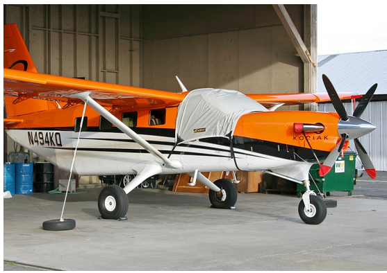
Quest Kodiak Windshield Cover, Prop Tie/Exhaust Covers, Engine Inlet Plugs & Pitot Cover