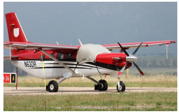
Quest Kodiak Windshield Cover, Prop Tie/Exhaust Covers, Engine Inlet Plugs & Pitot Cover