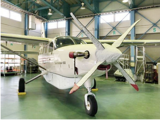
Quest Aircraft Kodiak Insulated Propellor/Spinner Cover, 4 Blade

water resistance, UV resistance and anti-static buildup. The inner lining is a very soft and smooth microfiber to prevent scratching. The material is very reflective, and tests show that the cabin interior temperature can be reduced to near-ambient temperature on the hottest of days. It is water, ice and snow repellent, yet breathable to allow moisture to escape from between the cover and the aircraft surface.