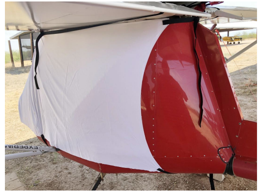
Rans S-12 Airaile Canopy/Nose Cover (test fit cover)