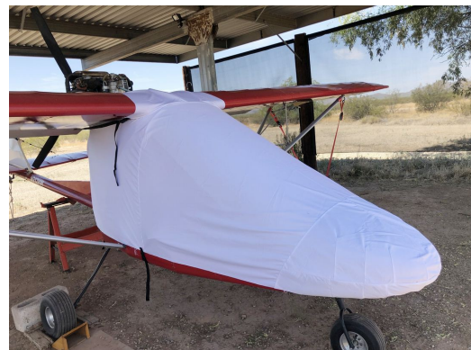
Rans S-12 Airaile Canopy/Nose Cover (test fit cover)