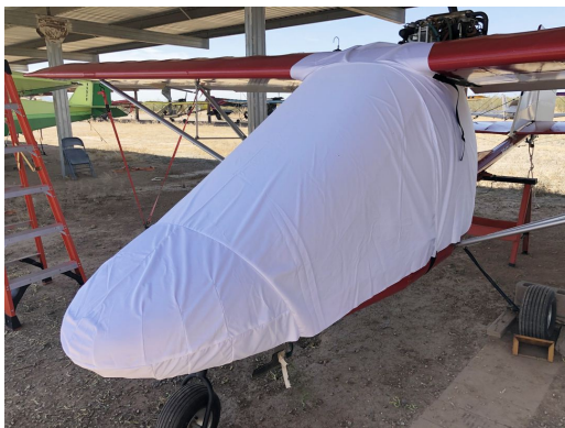
Rans S-12 Airaile Canopy/Nose Cover (test fit cover)

Travel Covers are made with Silver Solution-Dyed Polyester fabric and only lined over the windshield to save weight. The material is lightweight and more compact for easy stowage in the aircraft. The polyester material is water resistant, but only intended for occasional use outside. We also have an ultra lightweight material available for fitted hangar dust covers. For daily outdoor use, the non-travel Sunbrella Cover is the best choice.