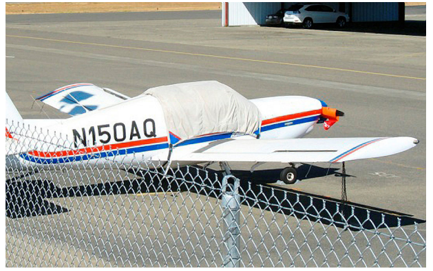
Koliber 150-A Canopy Cover