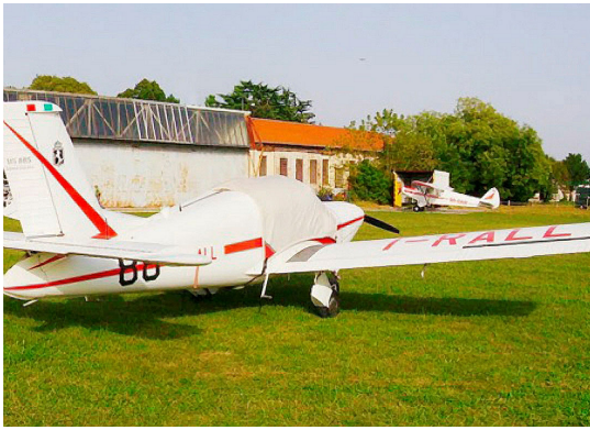
Standard Canopy Cover for MS893A