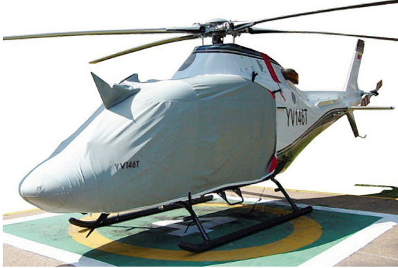
Koala Bubble Cover (with Wire Strike)

Travel Covers are made with Silver Solution-Dyed Polyester fabric and fully lined over the entire cover. The material is lightweight and more compact for easy stowage in the aircraft. The polyester material is water resistant, but only intended for occasional use outside. We also have an ultra lightweight material available for fitted hangar dust covers. For daily outdoor use, the non-travel Sunbrella Cover is the best choice.