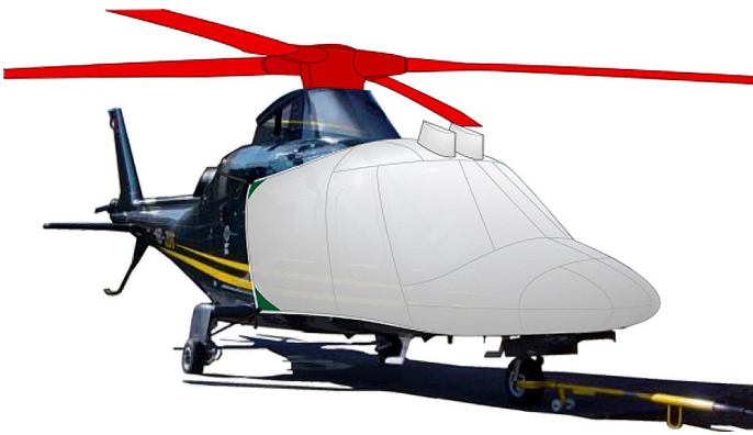
Agusta 109 Bubble, Rotor Hub & Blade Covers (illustration)