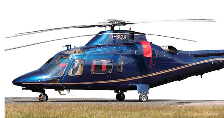
Agusta Power Intake Cover

WINTER USE MATERIAL - Made with Solution-Dyed Polyester fabric, this option is intended for seasonal use to aid in deicing, rain mitigation, or for occasional travel. The material is lighter and more compact, but more susceptible to UV damage and may have a shorter useful life if used continuously outside than the all-year use material.