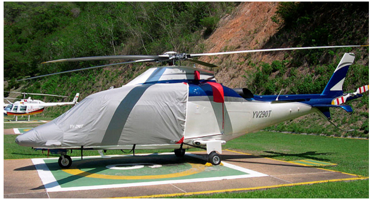
Agusta Grand Bubble Cover