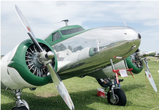
Lockheed 12 Pitot Covers

Lockheed 12 Electra Pitot Tube Covers , NOT HEAT RESISTANT TYPE, are made of Naugahyde vinyl, and are designed to cover the entire pitot assembly. Slipping over the tube, the cover tightens around the base with a Velcro strap detail. A "Remove Before Flight" streamer is attached to the cover. Heat Resistant Pitot Covers are an upgrade to this design, and help prevent the pitot cover from melting onto the tube if the pitot heat is accidentally turned on while installed. If you want the set tethered together, please let us know.