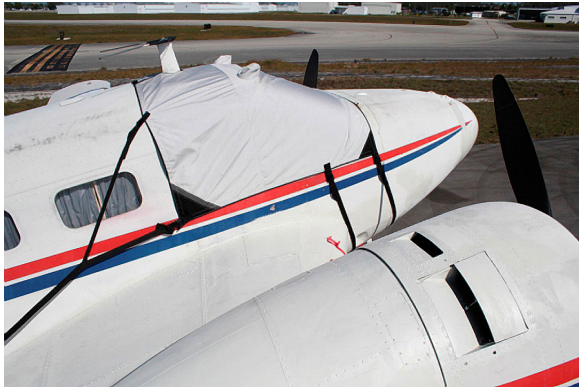
Beech 18 Cockpit Cover