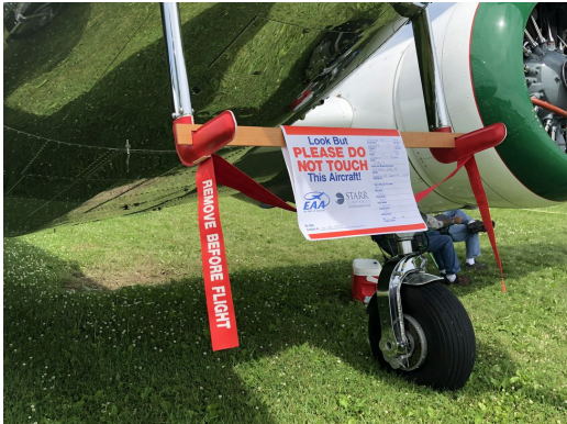
Lockheed 12 Pitot Covers