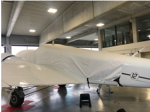
Lockheed 12 Canopy/Nose Cover

This cover type is made from Silver Acrylic Sunbrella canvas and is 100% lined with a soft and smooth microfiber. Bruce's Custom Covers developed this material combination especially for aircraft protection. The outer material is medium weight and treated for water resistance, UV resistance and anti-static buildup. The inner lining is a very soft and smooth microfiber to prevent scratching. The material is very reflective, and tests show that the cabin interior temperature can be reduced to near-ambient temperature on the hottest of days. It is water, ice and snow repellent, yet breathable to allow moisture to escape from between the cover and the aircraft surface.