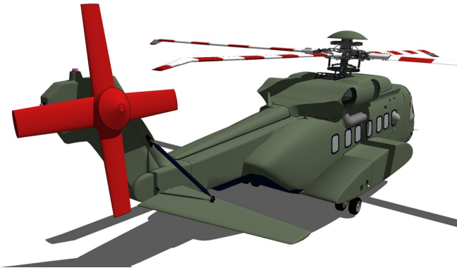
Sikorsky S-92 Tail Rotor Blade and Hub Covers