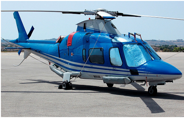
Agusta Power Cockpit HeatShields & Blade Tie-downs