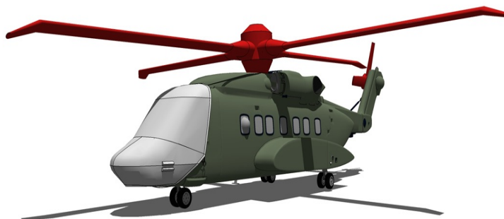
Sikorsky S-92 Windshield/Nose, Blade, Rotor Hub &amp; Tail Rotor Covers