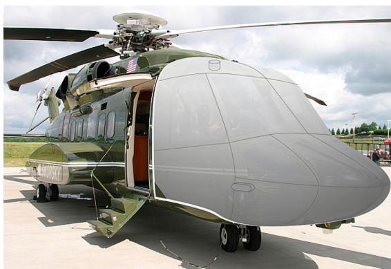
Sikorsky S-92 Windshield/Nose Cover (illustration)

This cover type is made from Silver Acrylic Sunbrella canvas and is 100% lined with a soft and smooth microfiber. Bruce's Custom Covers developed this material combination especially for aircraft protection. The outer material is medium weight and treated for water resistance, UV resistance and anti-static buildup. The inner lining is a very soft and smooth microfiber to prevent scratching. The material is very reflective, and tests show that the cabin interior temperature can be reduced to near-ambient temperature on the hottest of days. It is water, ice and snow repellent, yet breathable to allow moisture to escape from between the cover and the aircraft surface.