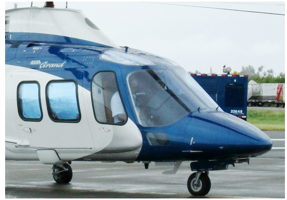
Agusta Grand Cabin & Skylight HeatShields