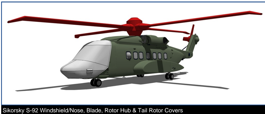
Sikorsky S-92 Windshield/Nose, Blade, Rotor Hub &amp; Tail Rotor Covers