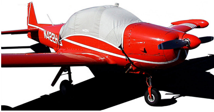
Navion Standard Canopy Cover on Long Slope Windshield Model