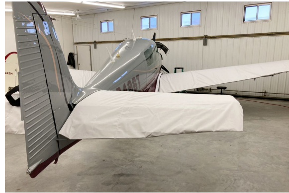
Navion Rangemaster Wing & Horizontal Stabilizer Covers