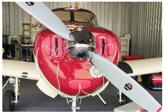
Ryan Navion B Engine Inlet Plugs