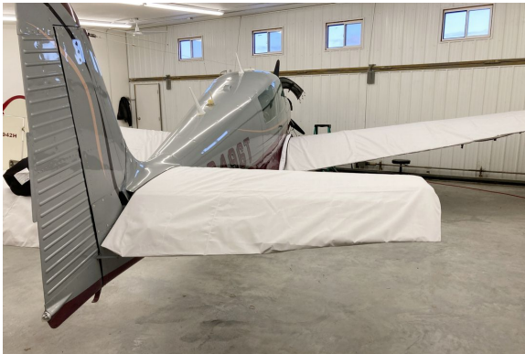
Navion Rangemaster Wing & Horizontal Stabilizer Covers