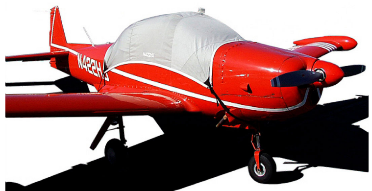
Navion Standard Canopy Cover on Long Slope Windshield Model