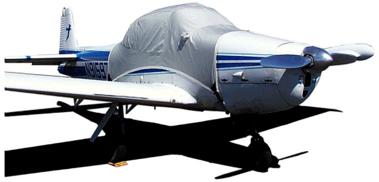
Navion Canopy Cover extends forward to firewall line.