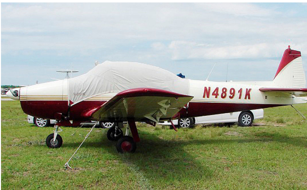
Navion Canopy Cover

This cover type is made from Silver Acrylic Sunbrella canvas and is 100% lined with a soft and smooth microfiber. Bruce's Custom Covers developed this material combination especially for aircraft protection. The outer material is medium weight and treated for water resistance, UV resistance and anti-static buildup. The inner lining is a very soft and smooth microfiber to prevent scratching. The material is very reflective, and tests show that the cabin interior temperature can be reduced to near-ambient temperature on the hottest of days. It is water, ice and snow repellent, yet breathable to allow moisture to escape from between the cover and the aircraft surface.