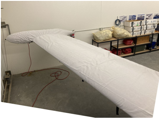
Navion Rangemaster Wing Covers

WINTER USE MATERIAL - Made with Solution-Dyed Polyester fabric, this option is intended for seasonal use to aid in deicing, rain mitigation, or for occasional travel. The material is lighter and more compact, but more susceptible to UV damage and may have a shorter useful life if used continuously outside than the all-year use material.