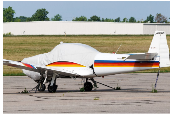
Navion Canopy Cover, Engine Cover (fully enclosed)