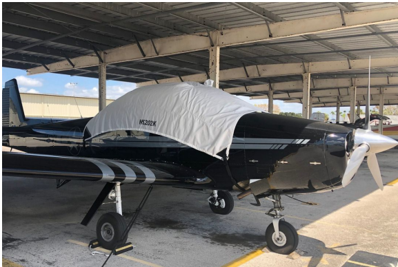
Navion L-17 Canopy Cover

This cover type is made from Silver Acrylic Sunbrella canvas and is 100% lined with a soft and smooth microfiber. Bruce's Custom Covers developed this material combination especially for aircraft protection. The outer material is medium weight and treated for water resistance, UV resistance and anti-static buildup. The inner lining is a very soft and smooth microfiber to prevent scratching. The material is very reflective, and tests show that the cabin interior temperature can be reduced to near-ambient temperature on the hottest of days. It is water, ice and snow repellent, yet breathable to allow moisture to escape from between the cover and the aircraft surface.