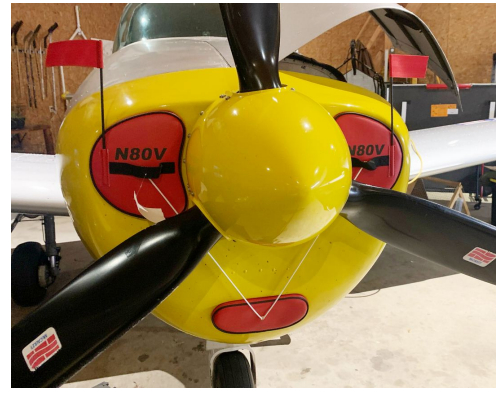
Navion L17 Engine Inlet Plugs