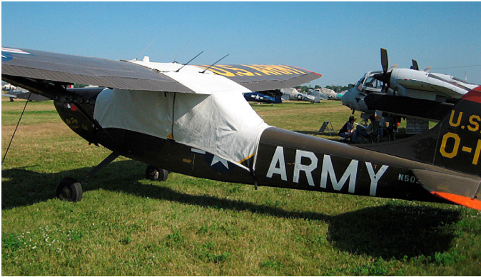
L-19 Canopy Cover

The material is very reflective, and tests show that the cabin interior temperature can be reduced to near-ambient temperature on the hottest of days. It is water, ice and snow repellent, yet breathable to allow moisture to escape from between the cover and the aircraft surface.