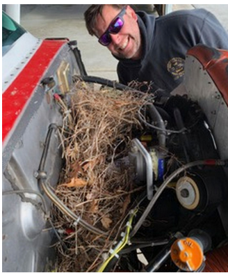
Cessna 172 Bird Nest Problem