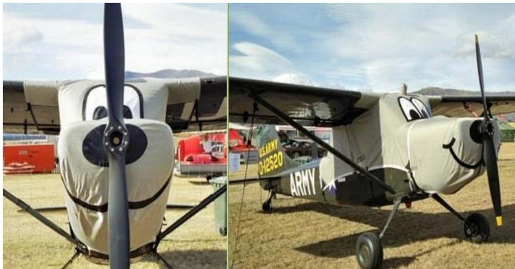
Cessna L-19 Bird Dog Canopy Cover, Engine Cover