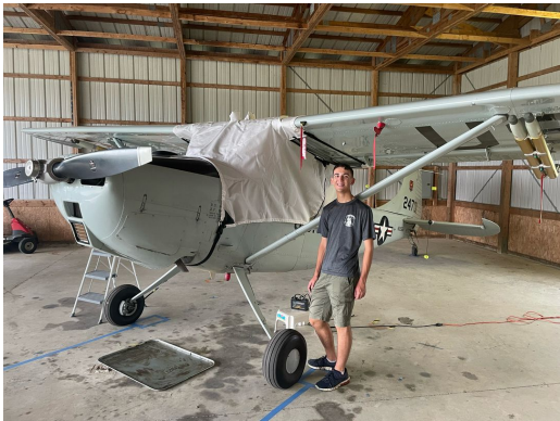
Cessna L-19E Bird Dog Over The Top Style Canopy Cover