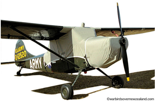
Cessna L-19 Canopy & Engine Covers