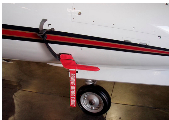
Learjet Heat Resistant Pitot Cover with AOA strap

The Engine Inlet Plugs are custom fit for your Lear 24 & 25 intakes, made with heavy-duty vinyl material, and stuffed with a single block of sculpted urethane foam. Each plug has a zipper that allows the foam to be removed and dried if necessary. Engine plugs have 'remove before flight' streamers sewn onto the face of the plugs. Most plugs are imprinted with the aircraft registration number in black for an extra charge. Storage bag NOT included. Engine plugs may be inserted after flight when the engine is still warm. Engine Inlet Plugs are commonly referred to as Cowl Plugs, Intake Plugs, Cowl Blocks, Engine Blocks, and Engine Bungs.