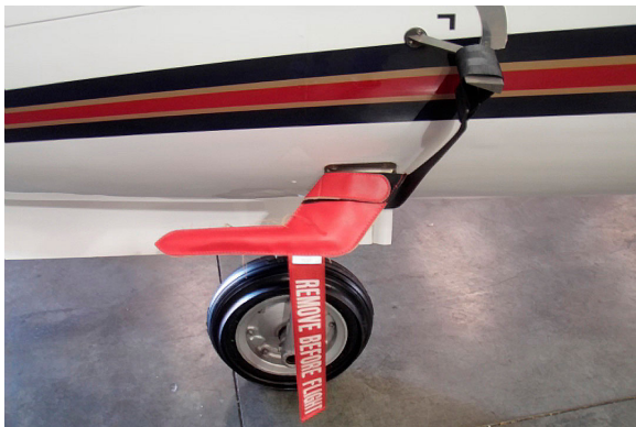
Learjet Heat Resistant Pitot Cover and AOA Strap

The Engine Inlet Plugs are custom fit for your Lear 24 & 25 intakes, made with heavy-duty vinyl material, and stuffed with a single block of sculpted urethane foam. Each plug has a zipper that allows the foam to be removed and dried if necessary. Engine plugs have 'remove before flight' streamers sewn onto the face of the plugs. Most plugs are imprinted with the aircraft registration number in black for an extra charge. Storage bag NOT included. Engine plugs may be inserted after flight when the engine is still warm. Engine Inlet Plugs are commonly referred to as Cowl Plugs, Intake Plugs, Cowl Blocks, Engine Blocks, and Engine Bungs.