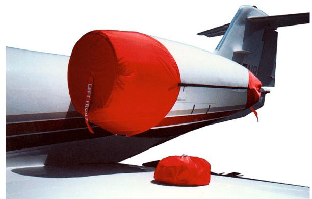
Lear 35 Engine Covers