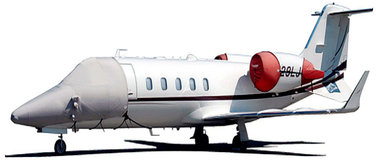
Lear 45 Windshield/Nose & Engine Cover Set