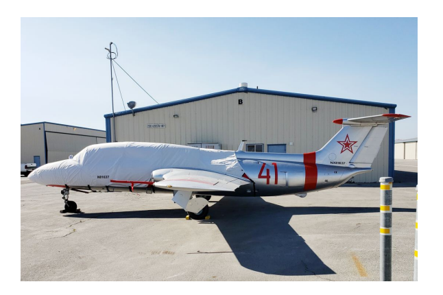
Aero L-29 Extended Canopy/Nose Cover