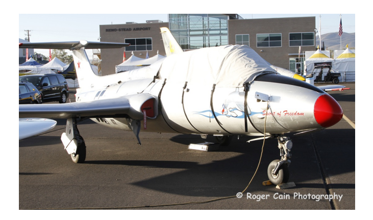
Aero L-29 Canopy Cover, Engine Plugs

Travel Covers are made with Silver Solution-Dyed Polyester fabric and only lined over the windshield to save weight. The material is lightweight and more compact for easy stowage in the aircraft. The polyester material is water resistant, but only intended for occasional use outside. We also have an ultra lightweight material available for fitted hangar dust covers. For daily outdoor use, the non-travel Sunbrella Cover is the best choice.