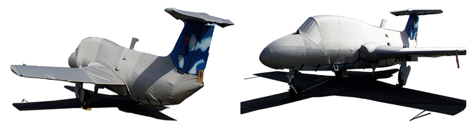
Fuselage, Wings & Horizontal Stabilizer Cover

mitigation, or for occasional travel. The material is lighter and more compact, but more susceptible to UV damage and may have a shorter useful life if used continuously outside than the all-year use material.