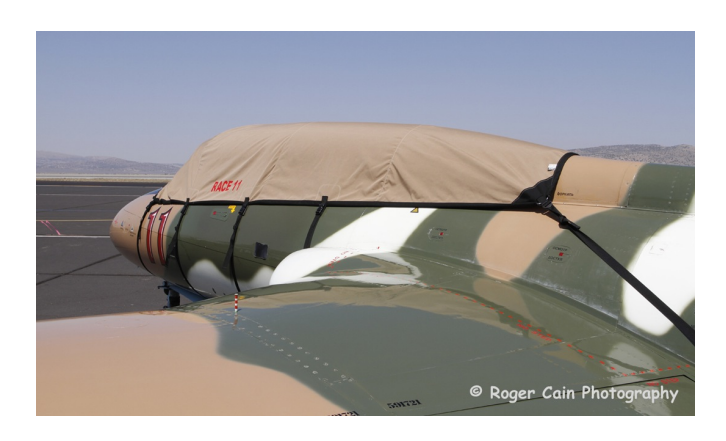
Aero L-29 Canopy Cover