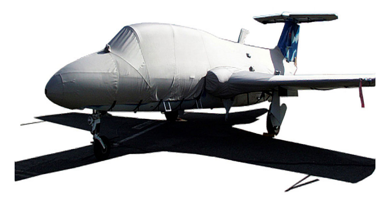
Fuselage, Wings & Horizontal Stabilizer Cover