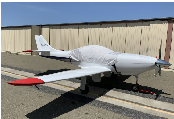
Lancair Legacy 2000 Wingtip & Horiz. Stab. Pads

Designed to prevent damage to the aircraft extremities in crowded hangars, these products are made of bright red Naugahyde and thickly padded with a sandwich of closed cell foam.