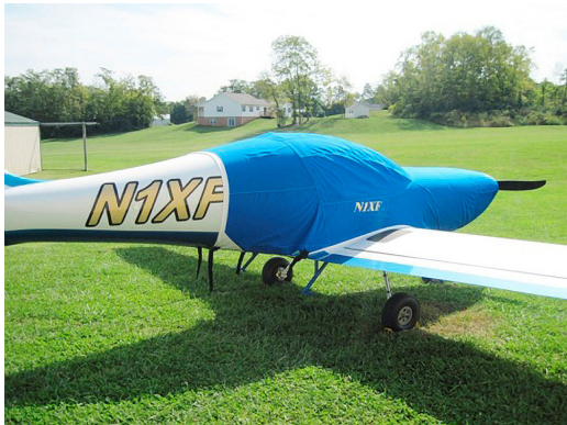
Arion Lightning Extended Canopy/Engine Cover

This cover type is made from Silver Acrylic Sunbrella canvas and is 100% lined with a soft and smooth microfiber. Bruce's Custom Covers developed this material combination especially for aircraft protection. The outer material is medium weight and treated for water resistance, UV resistance and anti-static buildup. The inner lining is a very soft and smooth microfiber to prevent scratching. The material is very reflective, and tests show that the cabin interior temperature can be reduced to near-ambient temperature on the hottest of days. It is water, ice and snow repellent, yet breathable to allow moisture to escape from between the cover and the aircraft surface.