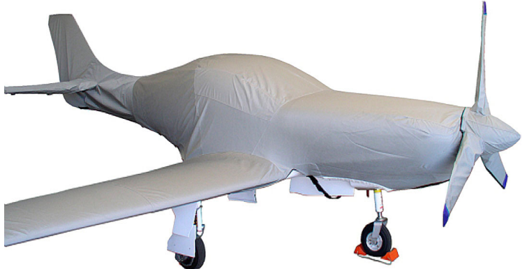
Lancair 320 Complete Fuselage/Wing Cover & Prop Cover