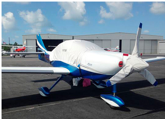
Lancair Canopy Cover, Plugs & Prop Cover