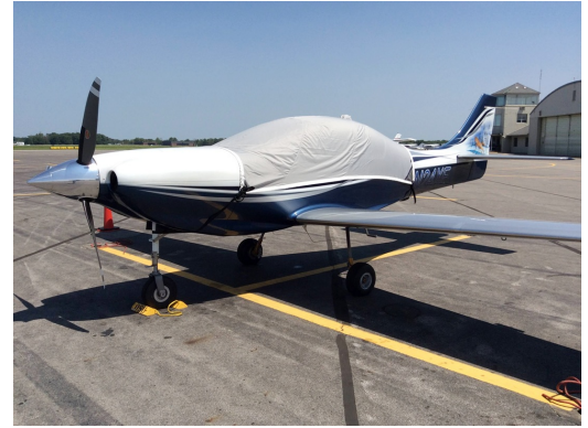
Lancair IV Light Weight Travel Canopy Cover