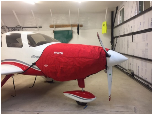
Lancair ES Insulated Engine Cover, Fully Enclosed

This cover type is made from Silver Acrylic Sunbrella canvas and is 100% lined with a soft and smooth microfiber. Bruce's Custom Covers developed this material combination especially for aircraft protection. The outer material is medium weight and treated for water resistance, UV resistance and anti-static buildup. The inner lining is a very soft and smooth microfiber to prevent scratching. The material is very reflective, and tests show that the cabin interior temperature can be reduced to near-ambient temperature on the hottest of days. It is water, ice and snow repellent, yet breathable to allow moisture to escape from between the cover and the aircraft surface.