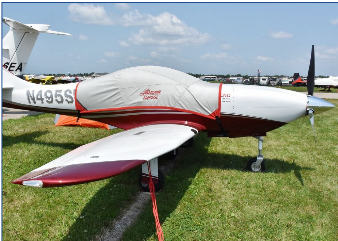
Lancair Legacy Canopy Cover