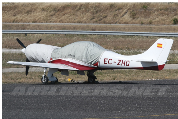
Lancair 360 Canopy Cover, Engine Cover

This cover type is made from Silver Acrylic Sunbrella canvas and is 100% lined with a soft and smooth microfiber. Bruce's Custom Covers developed this material combination especially for aircraft protection. The outer material is medium weight and treated for water resistance, UV resistance and anti-static buildup. The inner lining is a very soft and smooth microfiber to prevent scratching. The material is very reflective, and tests show that the cabin interior temperature can be reduced to near-ambient temperature on the hottest of days. It is water, ice and snow repellent, yet breathable to allow moisture to escape from between the cover and the aircraft surface.