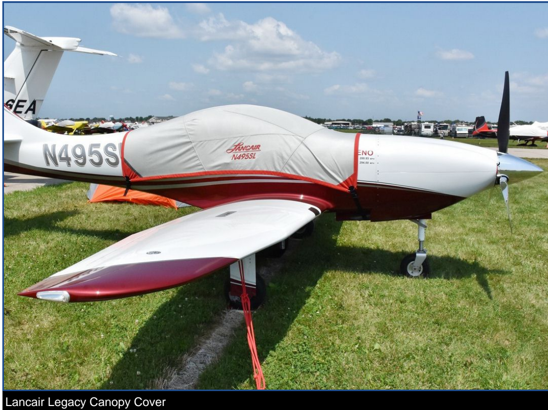
Lancair Legacy Canopy Cover