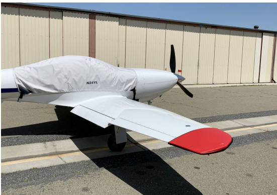
Lancair Legacy 2000 Wingtip & Horiz. Stab. Pads