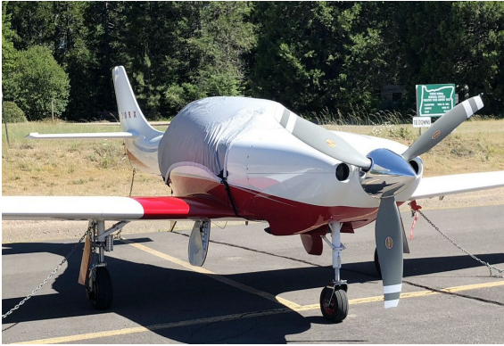
Lancair Legacy 2000 Travel Cover, Light Weight Travel Canopy Cover

non-travel Sunbrella Cover is the best choice.