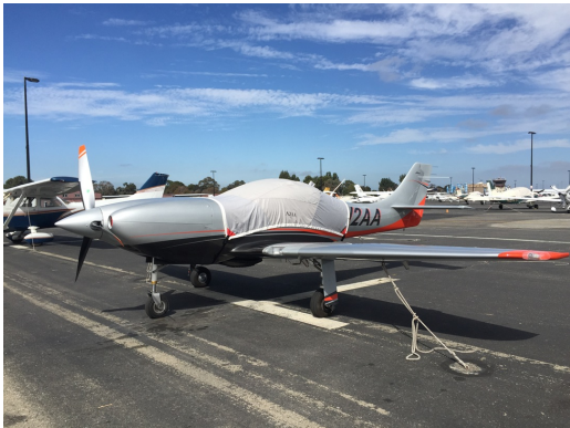
Lancair Legacy 2000 Travel Canopy Cover