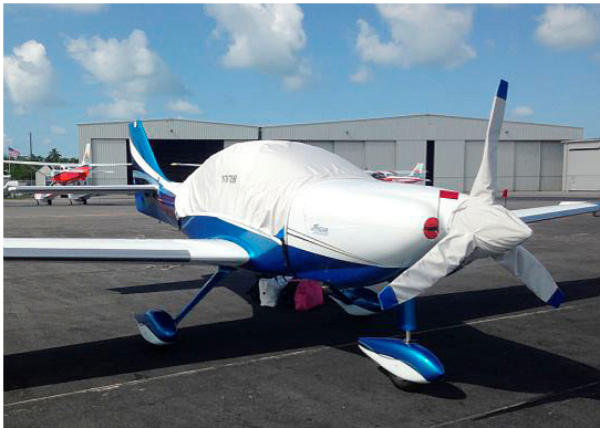
Lancair Canopy Cover, Plugs & Prop Cover