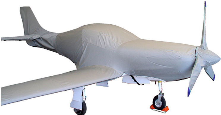
Lancair 320 Complete Fuselage/Wing Cover & Prop Cover