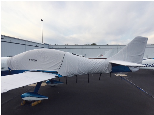
Lancair ES Wing Covers & Empennage Cover (sold separately)

WINTER USE MATERIAL - Made with Solution-Dyed Polyester fabric, this option is intended for seasonal use to aid in deicing, rain mitigation, or for occasional travel. The material is lighter and more compact, but more susceptible to UV damage and may have a shorter useful life if used continuously outside than the all-year use material.