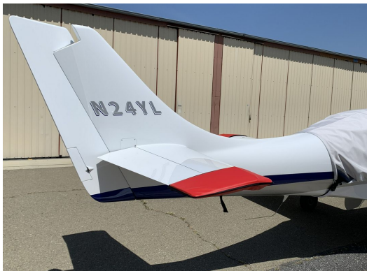
Lancair Legacy 2000 Wingtip & Horiz. Stab. Pads

Designed to prevent damage to the aircraft extremities in crowded hangars, these products are made of bright red Naugahyde and thickly padded with a sandwich of closed cell foam.