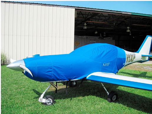
Arion Lightning Extended Canopy/Engine Cover