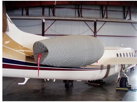
IAI Westwind 1124 Insulated Engine Nacelle Cover