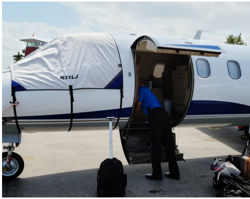
Lear 31A Cockpit Cover