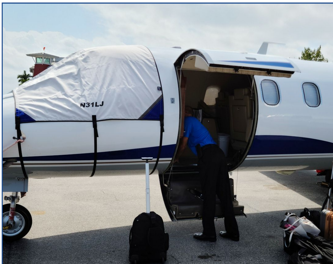
Lear 31A Cockpit Cover