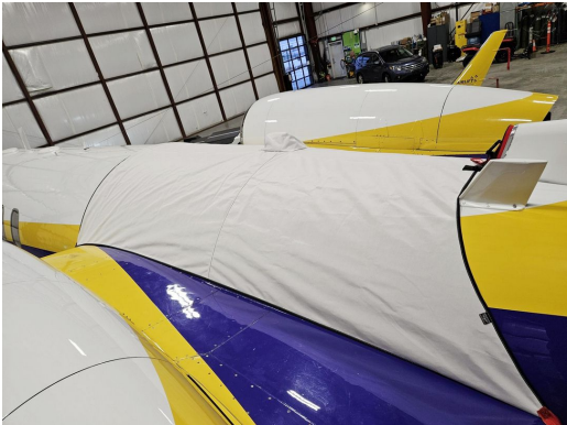
Lear 45 Empennage Saddle Cover W/ Dorsal Inlet Plug (Covers Upper Fuselage Between Pylons, Acm/Apu Area)