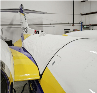
Lear 45 Empennage Saddle Cover W/ Dorsal Inlet Plug (Covers Upper Fuselage Between Pylons, Acm/Apu Area)

WINTER USE MATERIAL - Made with Solution-Dyed Polyester fabric, this option is intended for seasonal use to aid in deicing, rain mitigation, or for occasional travel. The material is lighter and more compact, but more susceptible to UV damage and may have a shorter useful life if used continuously outside than the all-year use material.