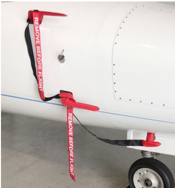
Lear 45 Pitot & Rosemont Cover Set