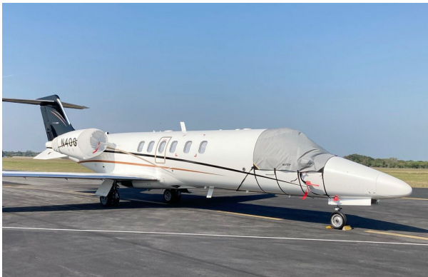
Lear 45 Light Weight Travel Cockpit Cover

This cover type is made from Silver Acrylic Sunbrella canvas and is 100% lined with a soft and smooth microfiber. Bruce's Custom Covers developed this material combination especially for aircraft protection. The outer material is medium weight and treated for water resistance, UV resistance and anti-static buildup. The inner lining is a very soft and smooth microfiber to prevent scratching. The material is very reflective, and tests show that the cabin interior temperature can be reduced to near-ambient temperature on the hottest of days. It is water, ice and snow repellent, yet breathable to allow moisture to escape from between the cover and the aircraft surface.