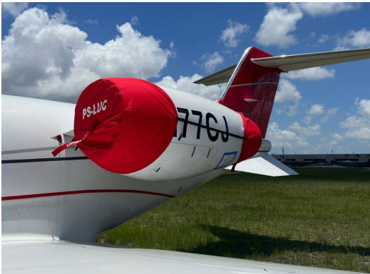
Lear 45 Engine Covers