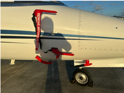
Lear 45 Pitot Cover Set

The Engine Inlet Plugs are custom fit for your Lear Models 40 & 45 intakes, made with heavy-duty vinyl material, and stuffed with a single block of sculpted urethane foam. Each plug has a zipper that allows the foam to be removed and dried if necessary. Engine plugs have 'remove before flight' streamers sewn onto the face of the plugs. Most plugs are imprinted with the aircraft registration number in black for an extra charge. Storage bag NOT included. Engine plugs may be inserted after flight when the engine is still warm. Engine Inlet Plugs are commonly referred to as Cowl Plugs, Intake Plugs, Cowl Blocks, Engine Blocks, and Engine Bungs.