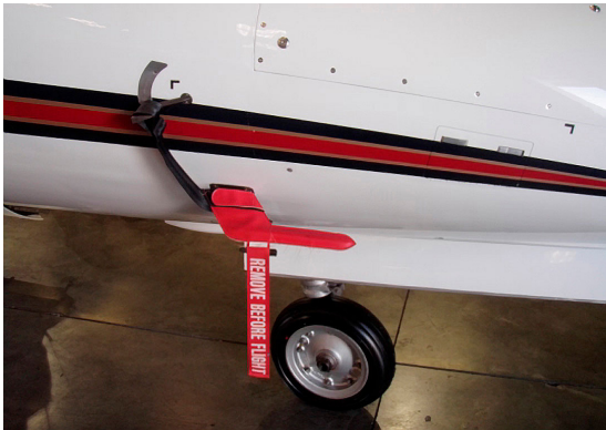
Learjet Heat Resistant Pitot Cover with AOA strap