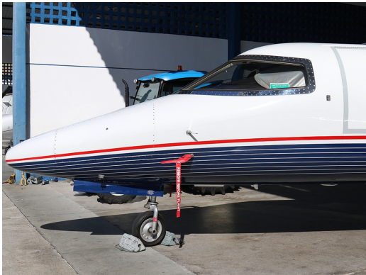
Lear Pitot Cover

The Engine Inlet Plugs are custom fit for your Lear 55 intakes, made with heavy-duty vinyl material, and stuffed with a single block of sculpted urethane foam. Each plug has a zipper that allows the foam to be removed and dried if necessary. Engine plugs have 'remove before flight' streamers sewn onto the face of the plugs. Most plugs are imprinted with the aircraft registration number in black for an extra charge. Storage bag NOT included. Engine plugs may be inserted after flight when the engine is still warm. Engine Inlet Plugs are commonly referred to as Cowl Plugs, Intake Plugs, Cowl Blocks, Engine Blocks, and Engine Bungs.