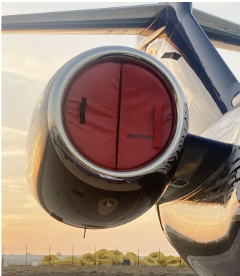
Legacy 500 Folding Intake Plugs

The Engine Inlet Plugs are custom fit for your Embraer Legacy 500 Praetor, (EMB-545/550) intakes, made with heavy-duty vinyl material, and stuffed with a single block of sculpted urethane foam. Each plug has a zipper that allows the foam to be removed and dried if necessary. Engine plugs have 'remove before flight' streamers sewn onto the face of the plugs. Most plugs are imprinted with the aircraft registration number in black for an extra charge. Storage bag NOT included. Engine plugs may be inserted after flight when the engine is still warm. Engine Inlet Plugs are commonly referred to as Cowl Plugs, Intake Plugs, Cowl Blocks, Engine Blocks, and Engine Bungs.