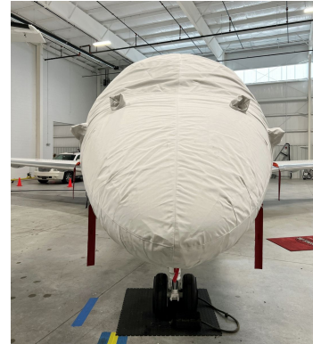
Embraer Legacy 500, (EMB-550) Cockpit/Nose Cover