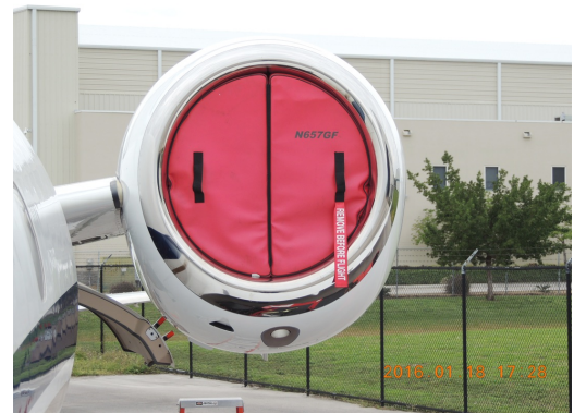
Embraer Legacy 500 Engine Inlet Plug, folding type