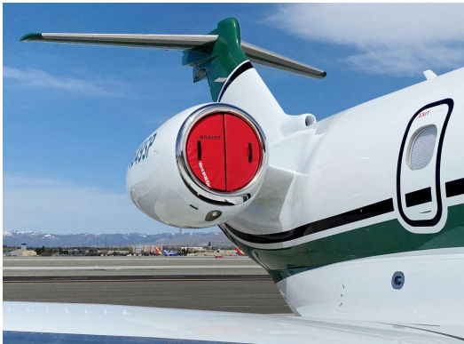
Embraer S A EMB-545 Engine Inlet & Exhaust Plug Set (folding type)