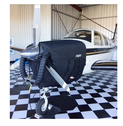
Beech Bonanza Full Cover Set