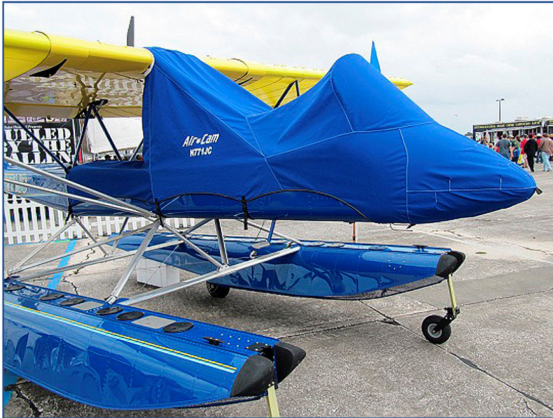
Lockwood AirCam Canopy/Nose Cover w/ aft baggage compartment extension