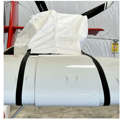
Lockwood Air Cam Engine Cover, test fit cover