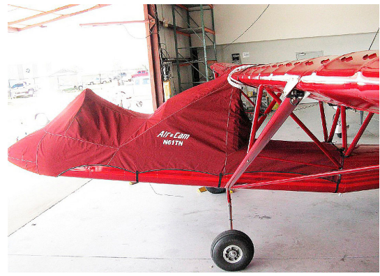
Lockwood AirCam Canopy/Nose Cover w/aft baggage compartment extension