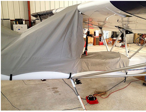
Lockwood AirCam Lightweight Travel Canopy/Nose Cover w/ aft baggage compartment ext