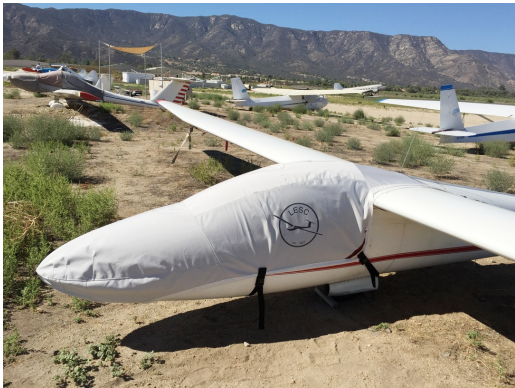
Pilatus B4 Canopy/Nose Cover