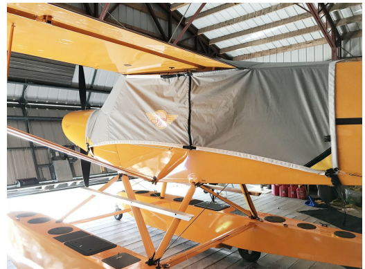
Legend Cub Light Weight Travel Cover