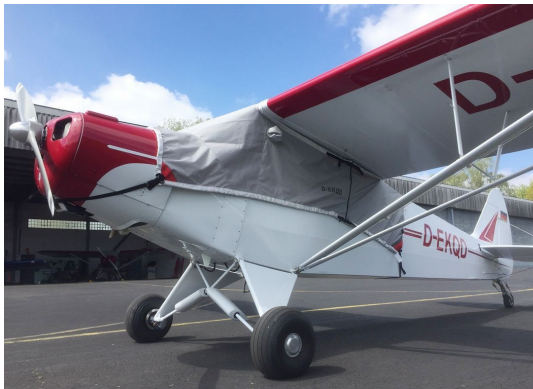
Piper Super Cub Travel Weight Canopy Cover

Travel Covers are made with Silver Solution-Dyed Polyester fabric and only lined over the windshield to save weight. The material is lightweight and more compact for easy stowage in the aircraft. The polyester material is water resistant, but only intended for occasional use outside. We also have an ultra lightweight material available for fitted hangar dust covers. For daily outdoor use, the non-travel Sunbrella Cover is the best choice.