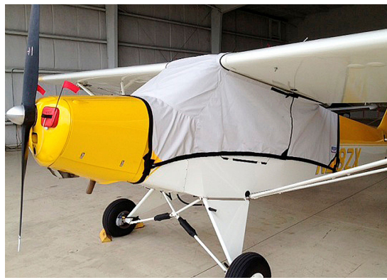
Legend Cub Over-Top Canopy Cover and Engine Plugs