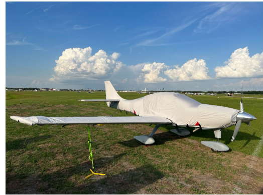
Lancair ES Complete Cover Set