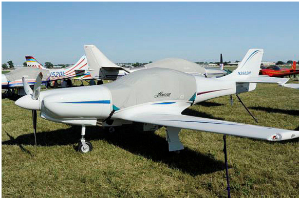
Lancair 360 MkII Canopy Cover