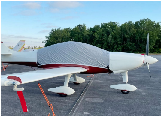
Lancair ES Travel Weight Canopy Cover

Travel Covers are made with Silver Solution-Dyed Polyester fabric and only lined over the windshield to save weight. The material is lightweight and more compact for easy stowage in the aircraft. The polyester material is water resistant, but only intended for occasional use outside. We also have an ultra lightweight material available for fitted hangar dust covers. For daily outdoor use, the non-travel Sunbrella Cover is the best choice.