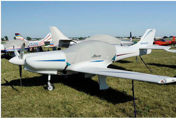
Lancair 360 MkII Canopy Cover

This cover type is made from Silver Acrylic Sunbrella canvas and is 100% lined with a soft and smooth microfiber. Bruce's Custom Covers developed this material combination especially for aircraft protection. The outer material is medium weight and treated for water resistance, UV resistance and anti-static buildup. The inner lining is a very soft and smooth microfiber to prevent scratching. The material is very reflective, and tests show that the cabin interior temperature can be reduced to near-ambient temperature on the hottest of days. It is water, ice and snow repellent, yet breathable to allow moisture to escape from between the cover and the aircraft surface.