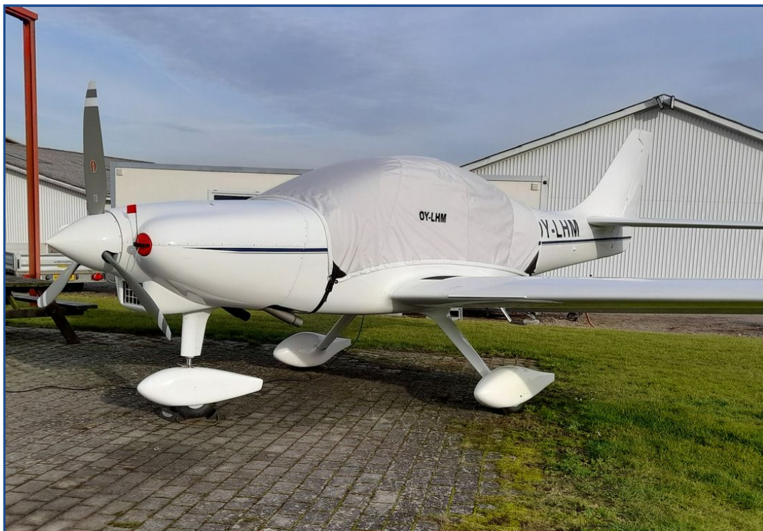
Lancair ES Canopy Cover