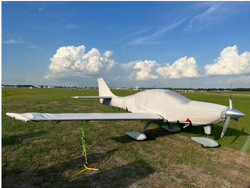
Lancair ES Complete Cover Set

WINTER USE MATERIAL - Made with Solution-Dyed Polyester fabric, this option is intended for seasonal use to aid in deicing, rain mitigation, or for occasional travel. The material is lighter and more compact, but more susceptible to UV damage and may have a shorter useful life if used continuously outside than the all-year use material.