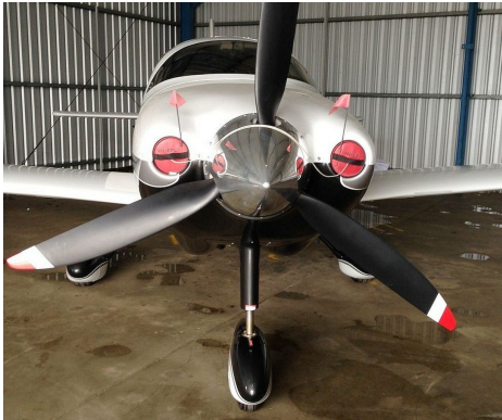
Columbia 350 Engine Plugs