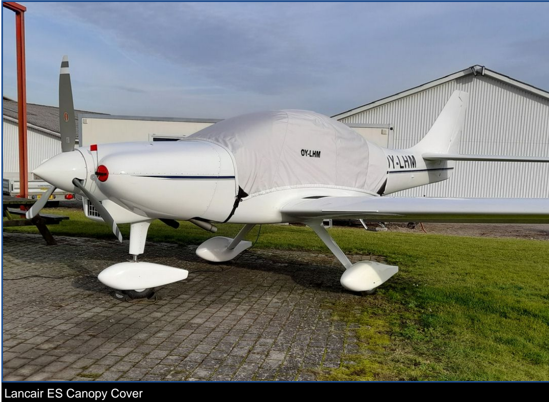
Lancair ES Canopy Cover