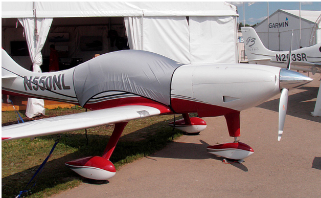
Light Weight Travel-Cover

This cover type is made from Silver Acrylic Sunbrella canvas and is 100% lined with a soft and smooth microfiber. Bruce's Custom Covers developed this material combination especially for aircraft protection. The outer material is medium weight and treated for water resistance, UV resistance and anti-static buildup. The inner lining is a very soft and smooth microfiber to prevent scratching. The material is very reflective, and tests show that the cabin interior temperature can be reduced to near-ambient temperature on the hottest of days. It is water, ice and snow repellent, yet breathable to allow moisture to escape from between the cover and the aircraft surface.