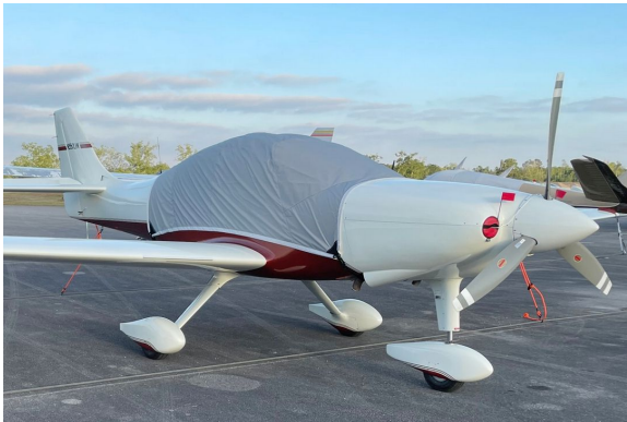
Lancair ES Travel Weight Canopy Cover