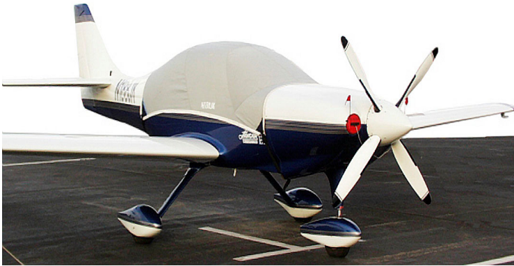
Lancair ES Canopy Cover

Travel Covers are made with Silver Solution-Dyed Polyester fabric and only lined over the windshield to save weight. The material is lightweight and more compact for easy stowage in the aircraft. The polyester material is water resistant, but only intended for occasional use outside. We also have an ultra lightweight material available for fitted hangar dust covers. For daily outdoor use, the non-travel Sunbrella Cover is the best choice.