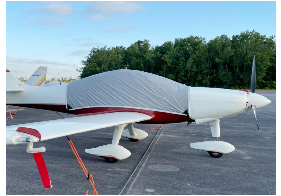
Lancair ES Travel Weight Canopy Cover