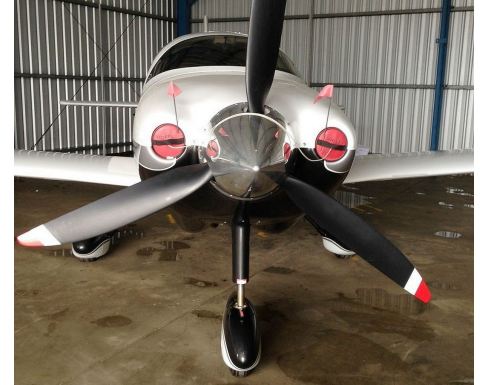
Columbia 350 Engine Plugs