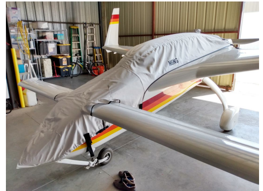
Rutan Long-EZ Canopy/Nose Cover