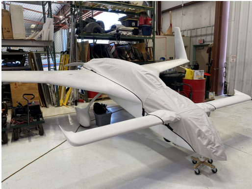
Rutan Long-EZ Canopy/Nose/Engine Cover

This cover type is made from Silver Acrylic Sunbrella canvas and is 100% lined with a soft and smooth microfiber. Bruce's Custom Covers developed this material combination especially for aircraft protection. The outer material is medium weight and treated for water resistance, UV resistance and anti-static buildup. The inner lining is a very soft and smooth microfiber to prevent scratching. The material is very reflective, and tests show that the cabin interior temperature can be reduced to near-ambient temperature on the hottest of days. It is water, ice and snow repellent, yet breathable to allow moisture to escape from between the cover and the aircraft surface.