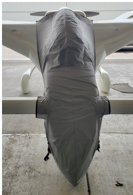
Rutan Long-EZ & Berkut Travel Cover, Light Weight Canopy/Nose Cover