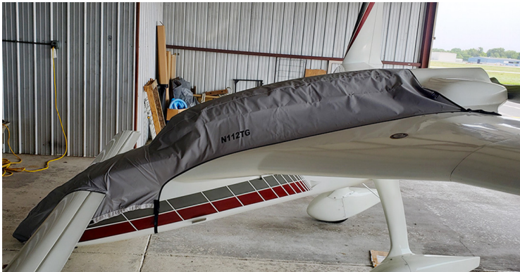
Rutan Long-EZ & Berkut Travel Cover, Light Weight Canopy/Nose Cover

Travel Covers are made with Silver Solution-Dyed Polyester fabric and only lined over the windshield to save weight. The material is lightweight and more compact for easy stowage in the aircraft. The polyester material is water resistant, but only intended for occasional use outside. We also have an ultra lightweight material available for fitted hangar dust covers. For daily outdoor use, the non-travel Sunbrella Cover is the best choice.