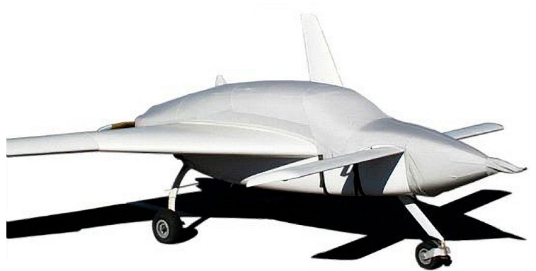
Velocity Canopy/Nose/Engine Cover