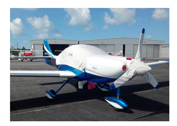
Lancair Canopy Cover, Plugs & Prop Cover

Engine Inlet Plugs are custom fit for your Lancair IV, LX7 intakes, made with heavy-duty vinyl material, and stuffed with a single block of sculpted urethane foam. Each plug has a zipper that allows the foam to be removed and dried if necessary. Engine plugs have warning flags that are visible from the cockpit or 'remove before flight' streamers sewn onto the face of the plugs. Most plugs are imprinted with the aircraft registration number in black for an extra charge. Storage bag NOT included. Engine plugs may be inserted after flight when the engine is still warm. Engine Inlet Plugs are commonly referred to as Cowl Plugs, Intake Plugs, Cowl Blocks, Engine Blocks, and Engine Bungs.