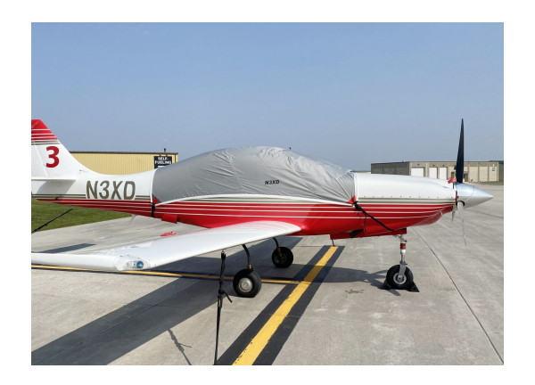
Lancair IV Travel Weight Canopy Cover