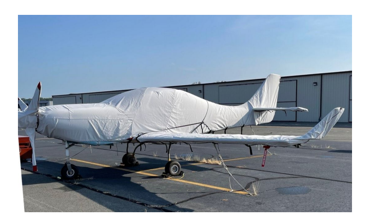
Lancair IV Complete Cover Set