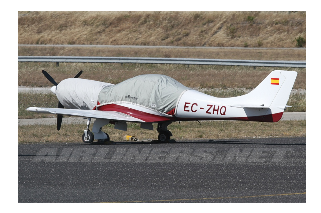
Lancair 360 Canopy Cover, Engine Cover

This cover type is made from Silver Acrylic Sunbrella canvas and is 100% lined with a soft and smooth microfiber. Bruce's Custom Covers developed this material combination especially for aircraft protection. The outer material is medium weight and treated for water resistance, UV resistance and anti-static buildup. The inner lining is a very soft and smooth microfiber to prevent scratching. The material is very reflective, and tests show that the cabin interior temperature can be reduced to near-ambient temperature on the hottest of days. It is water, ice and snow repellent, yet breathable to allow moisture to escape from between the cover and the aircraft surface.