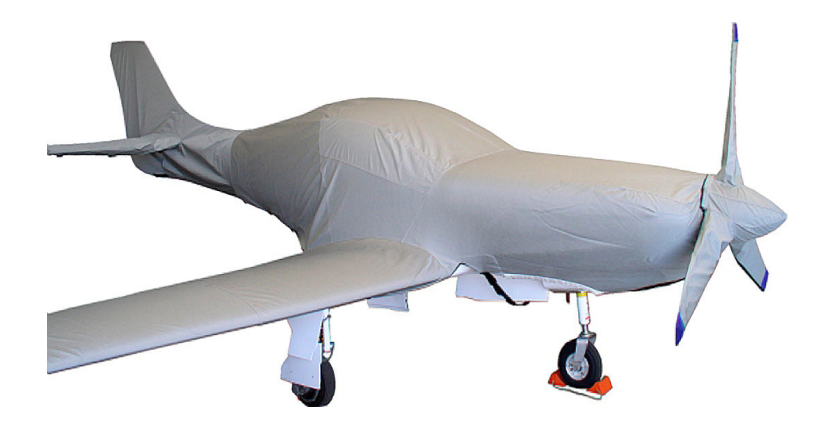
Lancair 320 Complete Fuselage/Wing Cover & Prop Cover