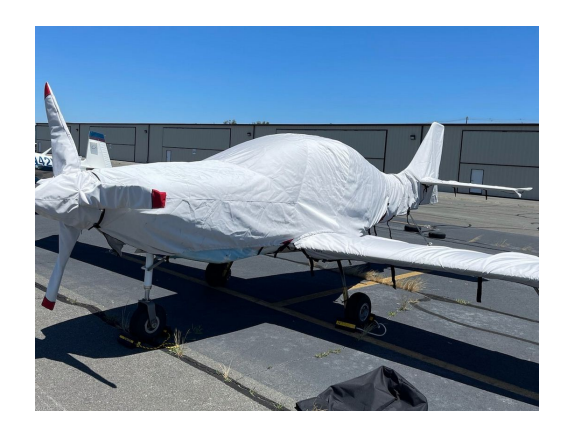
Lancair IV Complete Cover Set

This cover type is made from Silver Acrylic Sunbrella canvas and is 100% lined with a soft and smooth microfiber. Bruce's Custom Covers developed this material combination especially for aircraft protection. The outer material is medium weight and treated for water resistance, UV resistance and anti-static buildup. The inner lining is a very soft and smooth microfiber to prevent scratching. The material is very reflective, and tests show that the cabin interior temperature can be reduced to near-ambient temperature on the hottest of days. It is water, ice and snow repellent, yet breathable to allow moisture to escape from between the cover and the aircraft surface.