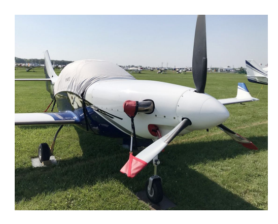
Lancair IV Prop Tie/Exhaust Covers