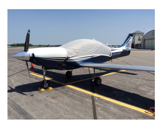
Lancair IV Light Weight Travel Canopy Cover

Travel Covers are made with Silver Solution-Dyed Polyester fabric and only lined over the windshield to save weight. The material is lightweight and more compact for easy stowage in the aircraft. The polyester material is water resistant, but only intended for occasional use outside. We also have an ultra lightweight material available for fitted hangar dust covers. For daily outdoor use, the non-travel Sunbrella Cover is the best choice.