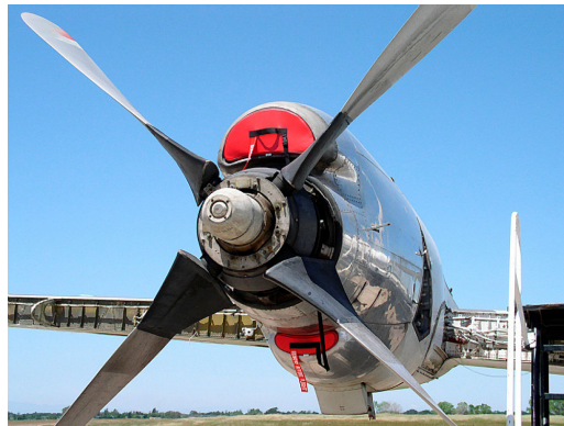
Lockheed P-3 Main Engine Inlet Plugs