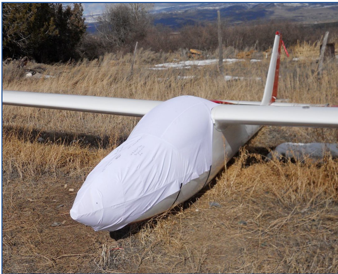
Laister LP-49 Canopy/Nose Cover, test fit cover