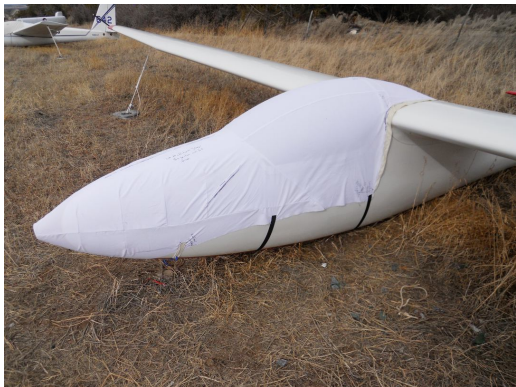
Laister LP-49 Canopy/Nose Cover, test fit cover

water resistance, UV resistance and anti-static buildup. The inner lining is a very soft and smooth microfiber to prevent scratching. The material is very reflective, and tests show that the cabin interior temperature can be reduced to near-ambient temperature on the hottest of days. It is water, ice and snow repellent, yet breathable to allow moisture to escape from between the cover and the aircraft surface.