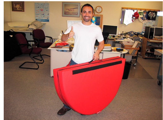
Boeing 737 FOD protection Intake Plug, folding type