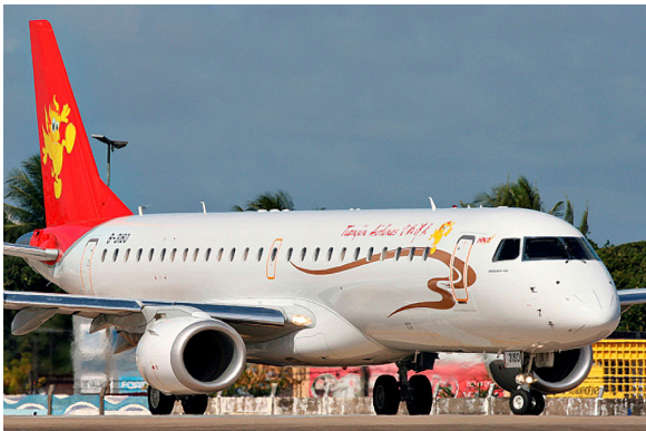
Covers, Plugs & HeatShields for Embraer 170/175/190/195

The Engine Inlet Plugs are custom fit for your Embraer EMB-170/175 intakes, made with heavy-duty vinyl material, and stuffed with a single block of sculpted urethane foam. Each plug has a zipper that allows the foam to be removed and dried if necessary. Engine plugs have 'remove before flight' streamers sewn onto the face of the plugs. Most plugs are imprinted with the aircraft registration number in black for an extra charge. Storage bag NOT included. Engine plugs may be inserted after flight when the engine is still warm. Engine Inlet Plugs are commonly referred to as Cowl Plugs, Intake Plugs, Cowl Blocks, Engine Blocks, and Engine Bungs.