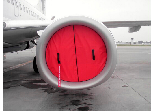
Boeing 737 Engine Intake Plug, Folding Type