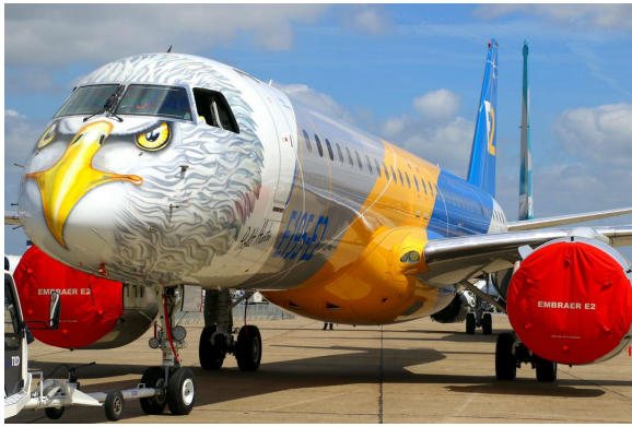
Embraer E195 Intake Covers