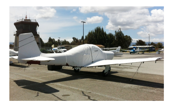
Meyers 200 Complete Cover Set