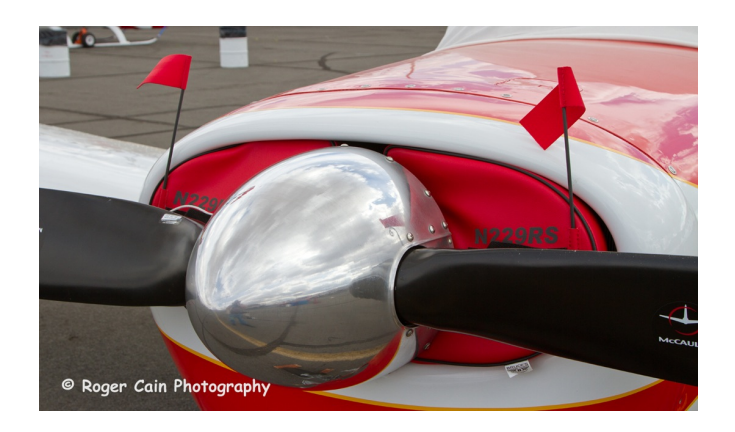
Meyer (Aero Commander) 200 Engine Plugs