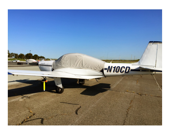
Meyer (Aero Commander) 200 Canopy Cover