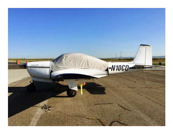
Meyer (Aero Commander) 200 Canopy Cover