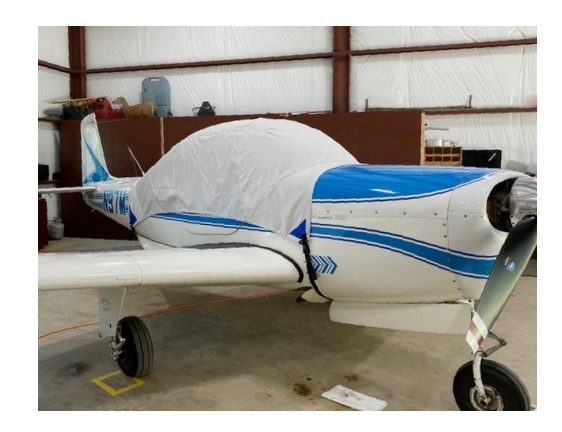
Meyers (Rockwell) 200 Canopy Cover

This cover type is made from Silver Acrylic Sunbrella canvas and is 100% lined with a soft and smooth microfiber. Bruce's Custom Covers developed this material combination especially for aircraft protection. The outer material is medium weight and treated for water resistance, UV resistance and anti-static buildup. The inner lining is a very soft and smooth microfiber to prevent scratching. The material is very reflective, and tests show that the cabin interior temperature can be reduced to near-ambient temperature on the hottest of days. It is water, ice and snow repellent, yet breathable to allow moisture to escape from between the cover and the aircraft surface.