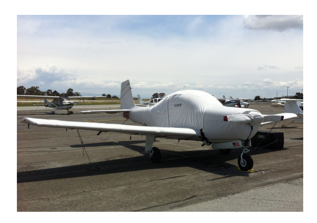
Meyers 200 Complete Cover Set

This cover type is made from Silver Acrylic Sunbrella canvas and is 100% lined with a soft and smooth microfiber. Bruce's Custom Covers developed this material combination especially for aircraft protection. The outer material is medium weight and treated for water resistance, UV resistance and anti-static buildup. The inner lining is a very soft and smooth microfiber to prevent scratching. The material is very reflective, and tests show that the cabin interior temperature can be reduced to near-ambient temperature on the hottest of days. It is water, ice and snow repellent, yet breathable to allow moisture to escape from between the cover and the aircraft surface.