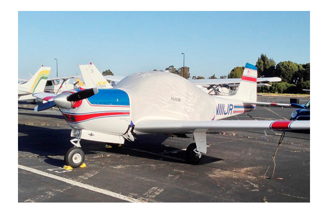
Meyers 200 Extended Canopy Cover & Engine Plugs