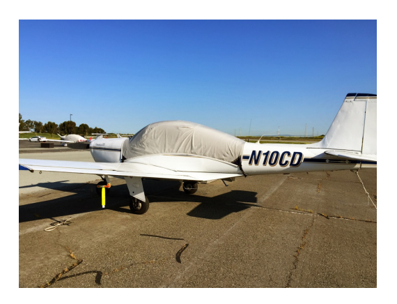
Meyer (Aero Commander) 200 Canopy Cover