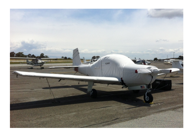
Meyers 200 Complete Cover Set