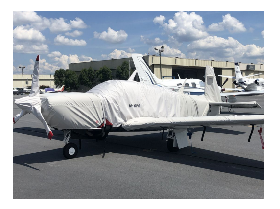
Mooney M20TN Acclaim Full Cover Set

Mooney M20M Bravo 3-Blade Prop Cover, Engine Plugs