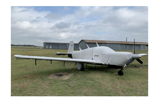
Mooney M20M Bravo Cover Set

This cover type is made from Silver Acrylic Sunbrella canvas and is 100% lined with a soft and smooth microfiber. Bruce's Custom Covers developed this material combination especially for aircraft protection. The outer material is medium weight and treated for water resistance, UV resistance and anti-static buildup. The inner lining is a very soft and smooth microfiber to prevent scratching. The material is very reflective, and tests show that the cabin interior temperature can be reduced to near-ambient temperature on the hottest of days. It is water, ice and snow repellent, yet breathable to allow moisture to escape from between the cover and the aircraft surface.