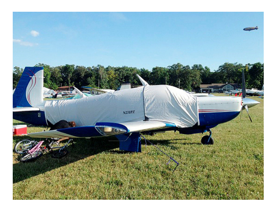
Mooney 231 Extended Canopy Cover