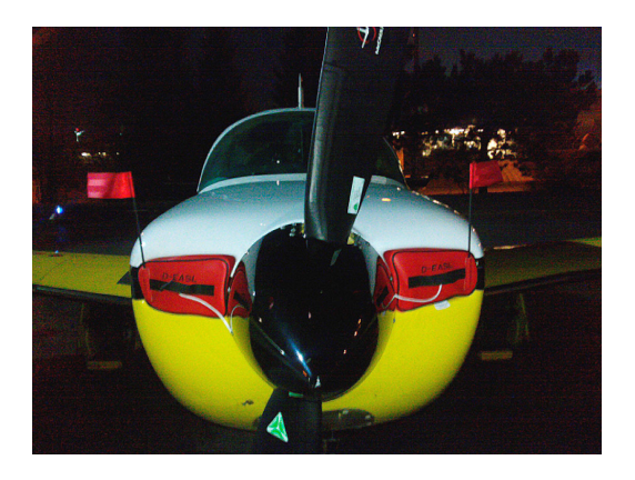
Mooney 231 Engine Inlet Plugs

Engine Inlet Plugs are custom fit for your Mooney M20V Acclaim Ultra intakes, made with heavy-duty vinyl material, and stuffed with a single block of sculpted urethane foam. Each plug has a zipper that allows the foam to be removed and dried if necessary. Engine plugs have warning flags that are visible from the cockpit or 'remove before flight' streamers sewn onto the face of the plugs. Most plugs are imprinted with the aircraft registration number in black for an extra charge. Storage bag NOT included. Engine plugs may be inserted after flight when the engine is still warm. Engine Inlet Plugs are commonly referred to as Cowl Plugs, Intake Plugs, Cowl Blocks, Engine Blocks, and Engine Bungs.