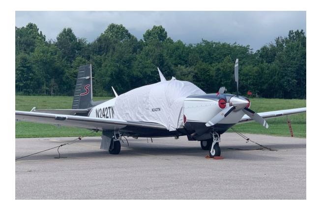
Mooney M20TN Extended Canopy Cover