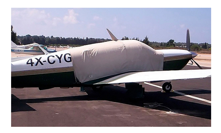
Mooney M20 Extended Canopy Cover

This cover type is made from Silver Acrylic Sunbrella canvas and is 100% lined with a soft and smooth microfiber. Bruce's Custom Covers developed this material combination especially for aircraft protection. The outer material is medium weight and treated for water resistance, UV resistance and anti-static buildup. The inner lining is a very soft and smooth microfiber to prevent scratching. The material is very reflective, and tests show that the cabin interior temperature can be reduced to near-ambient temperature on the hottest of days. It is water, ice and snow repellent, yet breathable to allow moisture to escape from between the cover and the aircraft surface.