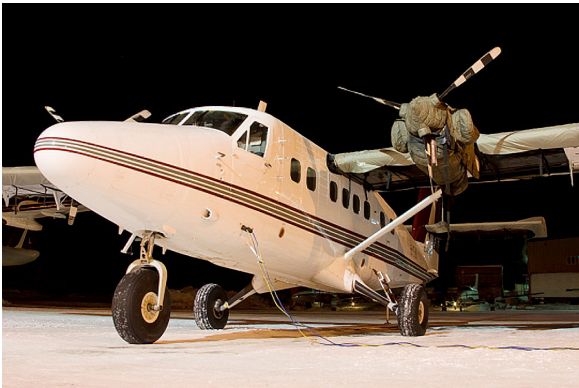
Twin Otter Wing, Horiz. Stab & Engine Covers