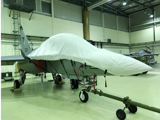
Alenia Aermacchi M-346 Canopy/Nose Cover

This cover type is made from Silver Acrylic Sunbrella canvas and is 100% lined with a soft and smooth microfiber. Bruce's Custom Covers developed this material combination especially for aircraft protection. The outer material is medium weight and treated for water resistance, UV resistance and anti-static buildup. The inner lining is a very soft and smooth microfiber to prevent scratching. The material is very reflective, and tests show that the cabin interior temperature can be reduced to near-ambient temperature on the hottest of days. It is water, ice and snow repellent, yet breathable to allow moisture to escape from between the cover and the aircraft surface.