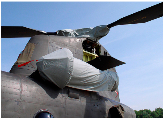
Boeing Vertol CH-47 Engine and Rotor Hub Covers

Insulated Covers Material - A special composite material of solution-dyed polyester, 3M Thinsulate insulation, and soft nylon interior fabric. Our insulated covers are designed to complement an engine preheater and help retain heat in the engine compartment after shutdown. If you operate your aircraft in cold-weather, these covers will help prevent engine wear and tear.