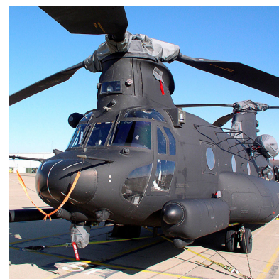
Boeing Vertol MH-47 Rotor Hubs, Engine & Other Covers