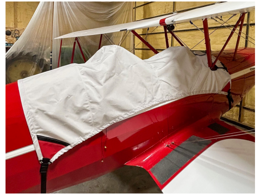
Marquardt Charger MA-5 Cockpit Cover