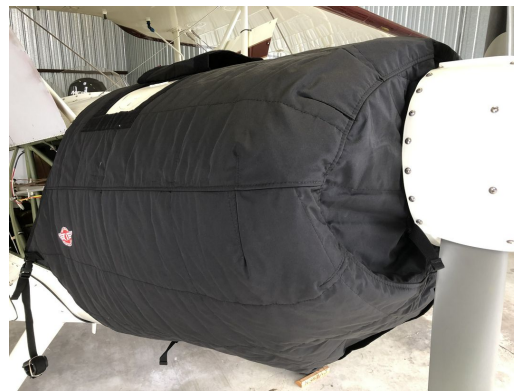
Marquardt Charger MA-5 Insulated Engine Cover