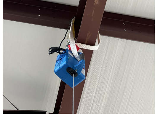
Stearman PT-13 Full Body Dust Cover, Remote Control Winch