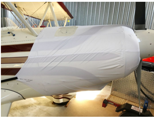
Marquardt Charger Insulated Engine Cover (test fit cover_