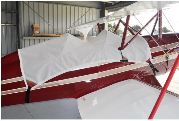
Starduster Too Canopy Cover