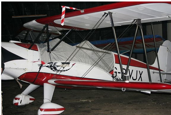
Marquardt Charger MA-5 Light Weight Travel Cockpit Cover

This cover type is made from Silver Acrylic Sunbrella canvas and is 100% lined with a soft and smooth microfiber. Bruce's Custom Covers developed this material combination especially for aircraft protection. The outer material is medium weight and treated for water resistance, UV resistance and anti-static buildup. The inner lining is a very soft and smooth microfiber to prevent scratching. The material is very reflective, and tests show that the cabin interior temperature can be reduced to near-ambient temperature on the hottest of days. It is water, ice and snow repellent, yet breathable to allow moisture to escape from between the cover and the aircraft surface.