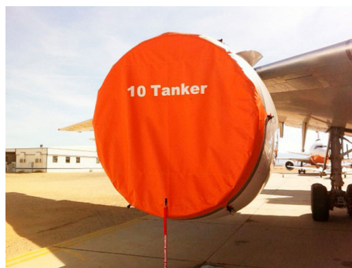
DC-10 Intake Cover