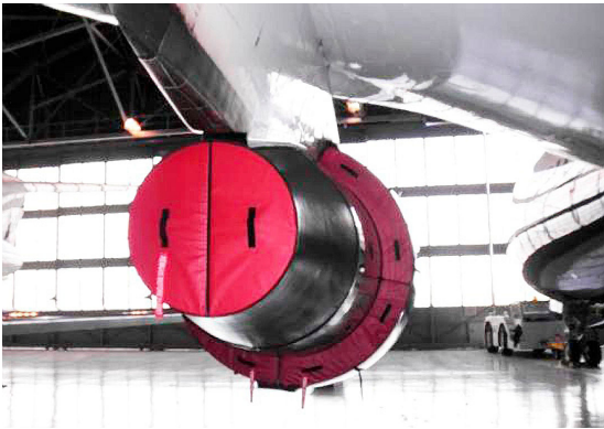
Exhaust Plugs Ship Set, incl. Fan Thrust Reverser and Exhaust Plugs P/N: B767-200

The Engine Inlet Plugs are custom fit for your McDonnell Douglas MD-11 intakes, made with heavy-duty vinyl material, and stuffed with a single block of sculpted urethane foam. Each plug has a zipper that allows the foam to be removed and dried if necessary. Engine plugs have 'remove before flight' streamers sewn onto the face of the plugs. Most plugs are imprinted with the aircraft registration number in black for an extra charge. Storage bag NOT included. Engine plugs may be inserted after flight when the engine is still warm. Engine Inlet Plugs are commonly referred to as Cowl Plugs, Intake Plugs, Cowl Blocks, Engine Blocks, and Engine Bungs.