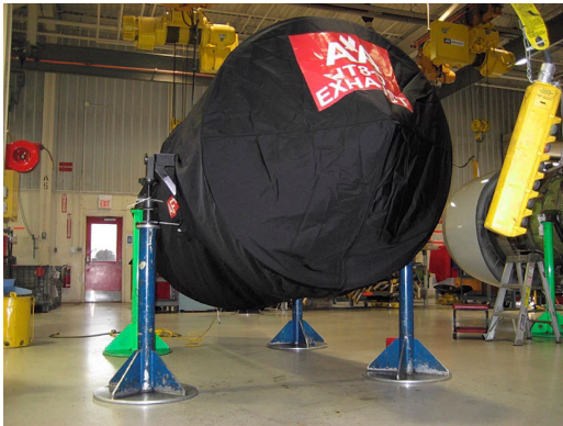
PW JT8D Off-Link Engine Transport Cover (no nose cone, no TR's), fully enclosed