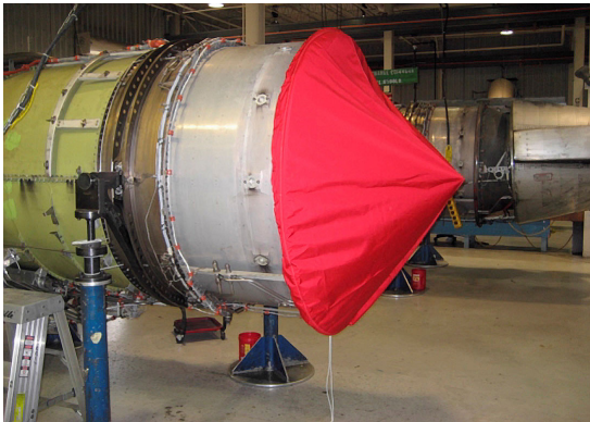
PW JT8D Off-Link Engine Shower Cap Cover Set

material, and stuffed with a single block of sculpted urethane foam. Each plug has a zipper that allows the foam to be removed and dried if necessary. Engine plugs have 'remove before flight' streamers sewn onto the face of the plugs. Most plugs are imprinted with the aircraft registration number in black for an extra charge. Storage bag NOT included. Engine plugs may be inserted after flight when the engine is still warm. Engine Inlet Plugs are commonly referred to as Cowl Plugs, Intake Plugs, Cowl Blocks, Engine Blocks, and Engine Bungs.