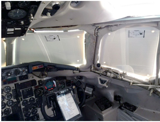
McDonnell Douglas MD80 Cockpit Heatshield Set