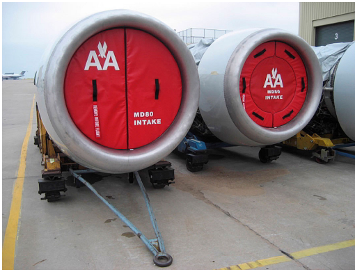
MD-80 JT8D Intake Plugs, Solid Foam folding type& Mesh Center folding type