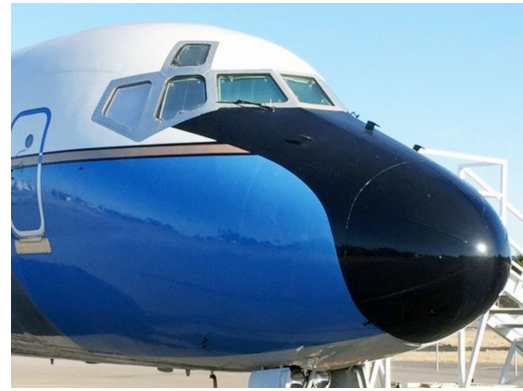
McDonnell Douglas MD80 Cockpit Heatshield Set