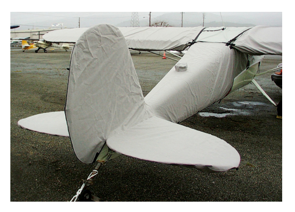
Cessna 140 Canopy, Wings, Prop, Tires & Empennage Covers