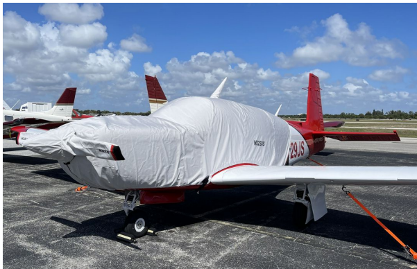
Mooney M20K Extended Canopy/Engine Cover, Prop Cover

This cover type is made from Silver Acrylic Sunbrella canvas and is 100% lined with a soft and smooth microfiber. Bruce's Custom Covers developed this material combination especially for aircraft protection. The outer material is medium weight and treated for water resistance, UV resistance and anti-static buildup. The inner lining is a very soft and smooth microfiber to prevent scratching. The material is very reflective, and tests show that the cabin interior temperature can be reduced to near-ambient temperature on the hottest of days. It is water, ice and snow repellent, yet breathable to allow moisture to escape from between the cover and the aircraft surface.