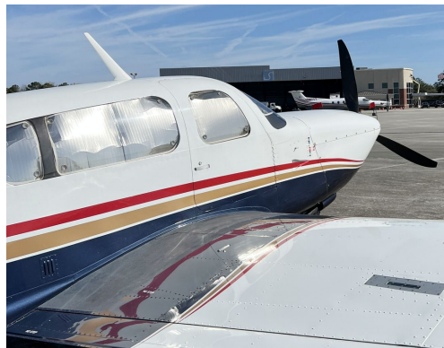
Mooney M20S Heatshield Set

Windshield Heatshields are interior sunshades for an aircraft's front windshield. The product is a unique composite of closed-cell foam with a silver mylar finish. The semi-rigid design is stiff enough to stand along the inside of the windshield using sun visors or window framing. It folds up flat and easily stores in the included storage sleeve. Some designs may require velcro and suction cups or split right and left sides. A Heatshield is an excellent short-term remedy for cockpit overheating. An external fabric cover is far more effective and practical for long-term protection.