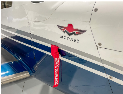
Mooney NACA Vent Plug

Engine Inlet Plugs are custom fit for your Mooney Ovation & Ovation Ultra intakes, made with heavy-duty vinyl material, and stuffed with a single block of sculpted urethane foam. Each plug has a zipper that allows the foam to be removed and dried if necessary. Engine plugs have warning flags that are visible from the cockpit or 'remove before flight' streamers sewn onto the face of the plugs. Most plugs are imprinted with the aircraft registration number in black for an extra charge. Storage bag NOT included. Engine plugs may be inserted after flight when the engine is still warm. Engine Inlet Plugs are commonly referred to as Cowl Plugs, Intake Plugs, Cowl Blocks, Engine Blocks, and Engine Bungs.