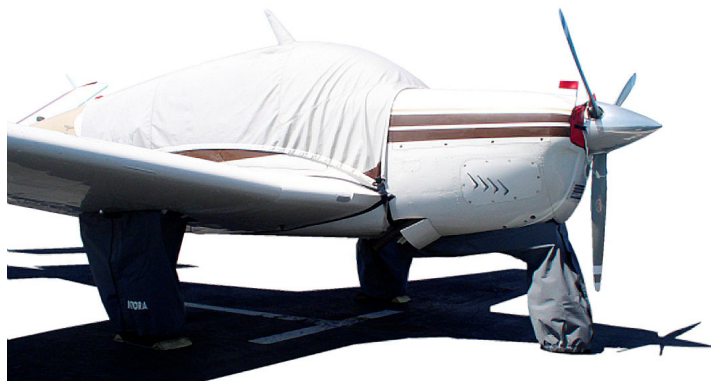
Beech Bonanza/Debonair/Baron Landing Gear Covers