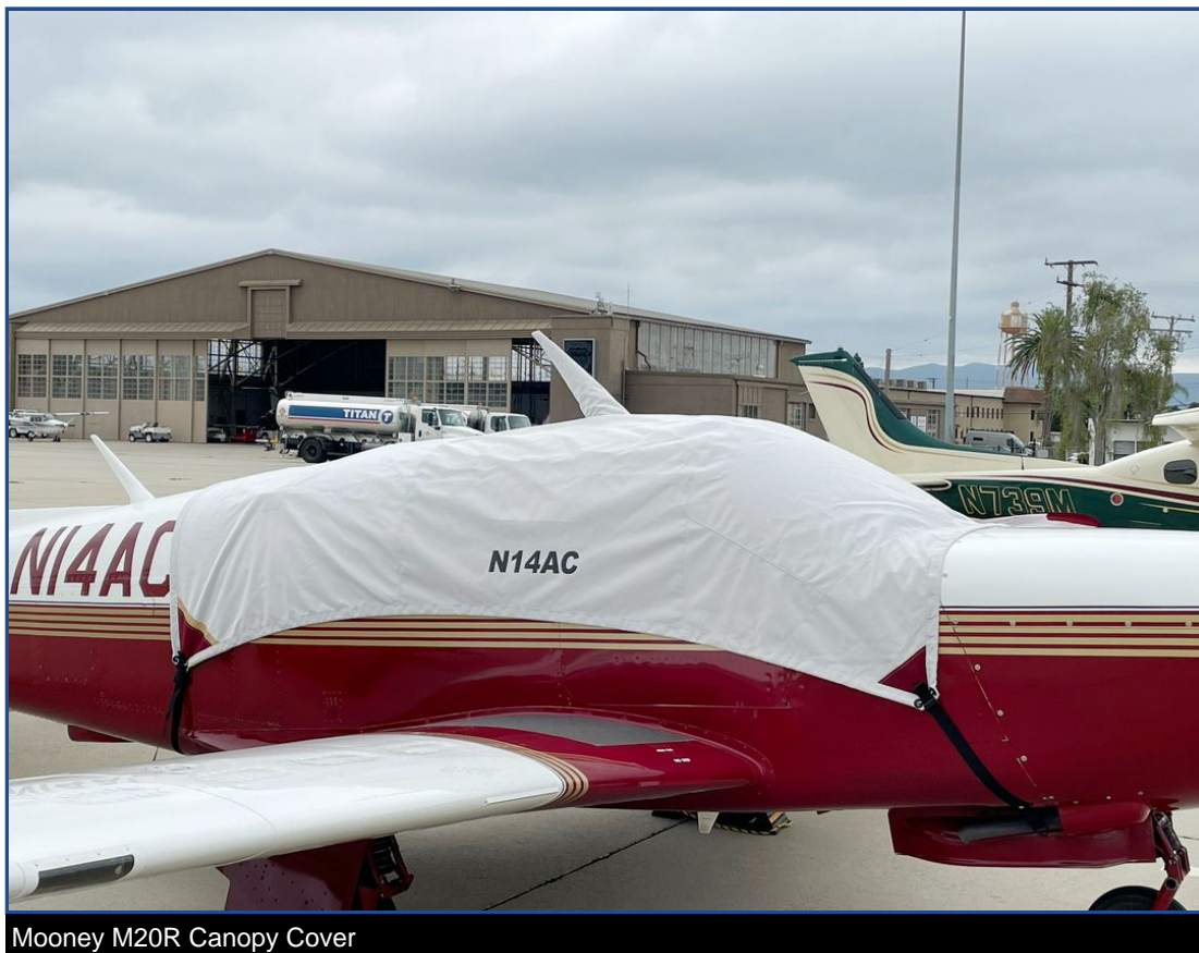
Mooney M20R Canopy Cover