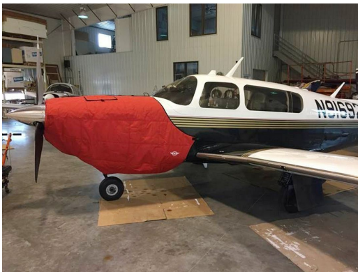
Mooney Ovation Insulated Engine Cover

This cover type is made from Silver Acrylic Sunbrella canvas and is 100% lined with a soft and smooth microfiber. Bruce's Custom Covers developed this material combination especially for aircraft protection. The outer material is medium weight and treated for water resistance, UV resistance and anti-static buildup. The inner lining is a very soft and smooth microfiber to prevent scratching. The material is very reflective, and tests show that the cabin interior temperature can be reduced to near-ambient temperature on the hottest of days. It is water, ice and snow repellent, yet breathable to allow moisture to escape from between the cover and the aircraft surface.