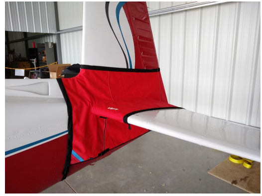
Mooney Tailcone Cover