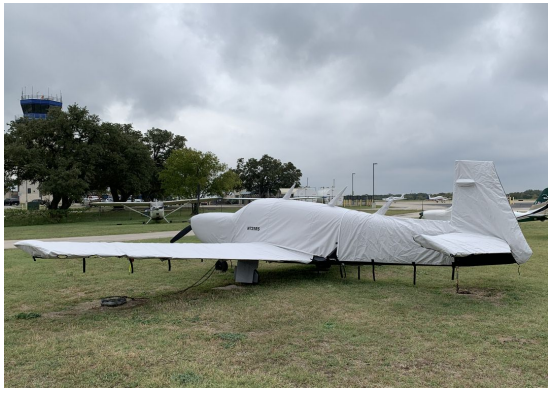
Mooney M20M Bravo Cover Set