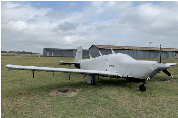
Mooney M20M Bravo Cover Set