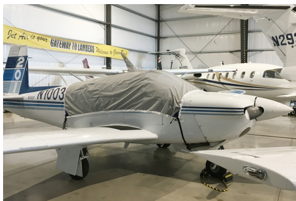
Mooney 201 Travel Cover, Light Weight Travel Canopy Cover, 5 Lbs

Travel Covers are made with Silver Solution-Dyed Polyester fabric and only lined over the windshield to save weight. The material is lightweight and more compact for easy stowage in the aircraft. The polyester material is water resistant, but only intended for occasional use outside. We also have an ultra lightweight material available for fitted hangar dust covers. For daily outdoor use, the non-travel Sunbrella Cover is the best choice.