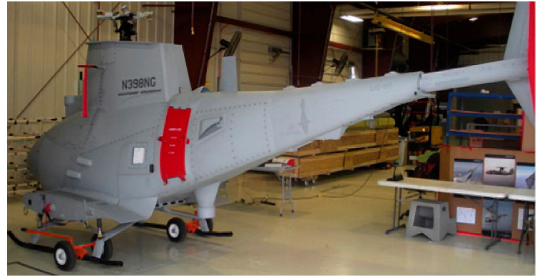
Covers & Plugs for the Northrup Grumman MQ-8 Fire Scout