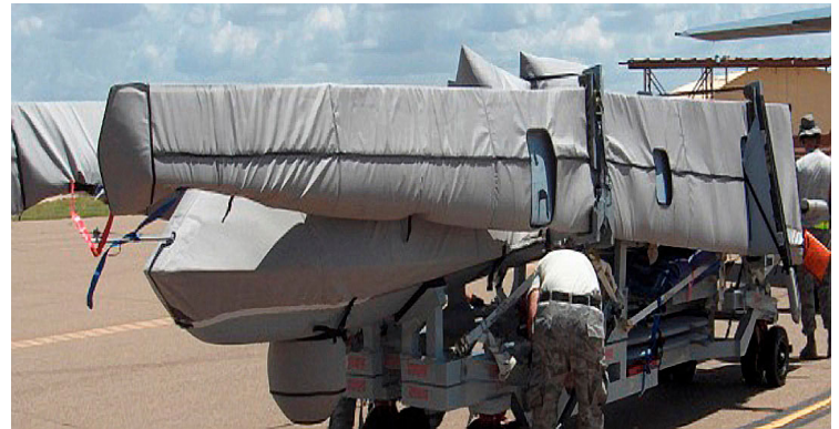
MQ1 Fuselage and Wing Covers