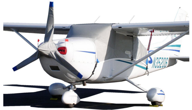
Cessna 182 Canopy Cover, Engine Plugs, 3-Blade Prop Cover