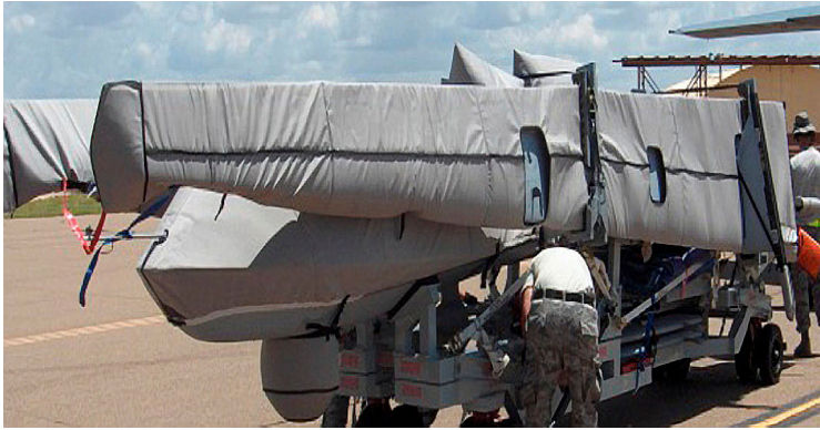
MQ1 Fuselage and Wing Covers

This cover type is made from Silver Acrylic Sunbrella canvas and is 100% lined with a soft and smooth microfiber. Bruce's Custom Covers developed this material combination especially for aircraft protection. The outer material is medium weight and treated for water resistance, UV resistance and anti-static buildup. The inner lining is a very soft and smooth microfiber to prevent scratching. The material is very reflective, and tests show that the cabin interior temperature can be reduced to near-ambient temperature on the hottest of days. It is water, ice and snow repellent, yet breathable to allow moisture to escape from between the cover and the aircraft surface.