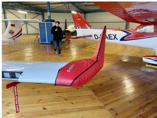
Diamond DA-40 Wingtip Pads

Designed to prevent damage to the aircraft extremities in crowded hangars, these products are made of bright red Naugahyde and thickly padded with a sandwich of closed cell foam.