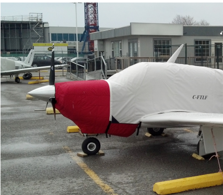
Mooney 201 Insulated Engine Cover, fully enclosed