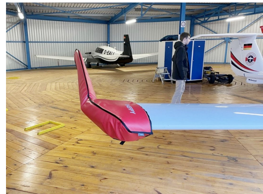
Diamond DA-40 Wingtip Pads