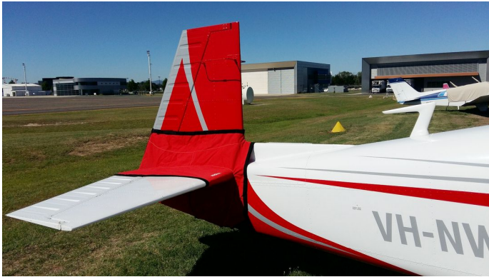
Mooney M20J Tailcone Cover

WINTER USE MATERIAL - Made with Solution-Dyed Polyester fabric, this option is intended for seasonal use to aid in deicing, rain mitigation, or for occasional travel. The material is lighter and more compact, but more susceptible to UV damage and may have a shorter useful life if used continuously outside than the all-year use material.