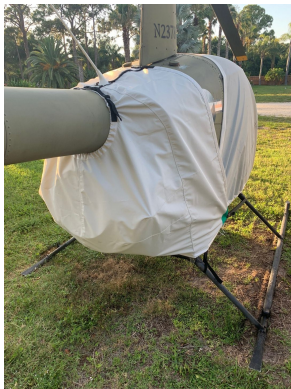
Robinson R-22 Engine Cover

Bruce's Autogyro MTO Sport, 2010, 2017 Gyrocopter Blade Covers are made of medium-weight Solution-Dyed Polyester and designed to avoid trim tabs or wicks. You can install Blade Covers from the ground with the aid of a lightweight rope attached to the open end. Covers are cinched tight at the blade root with straps and quick-release plastic buckles. The Cold Weather Blade Covers are fitted with full-length zippers and optional deice "boots" designed to accept a preheater hose; a small opening at the tip of the cover allows for some air circulation and drainage in freezing weather. Some part numbers have features for an extra charge.