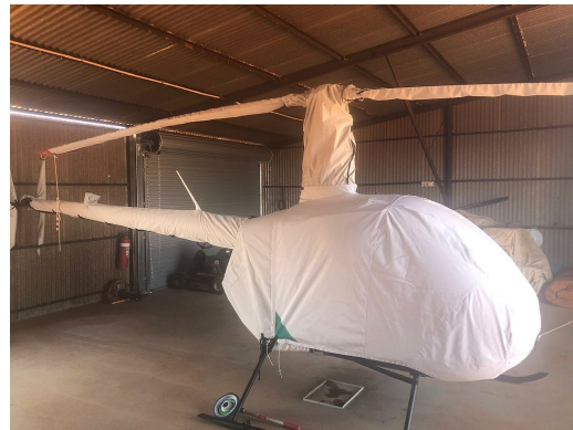
Robinson R-22 Full Cover Set