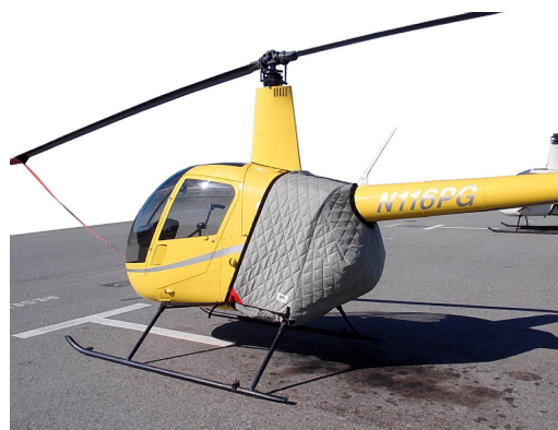
Robinson R-22 Insulated Engine Cover (also covers bottom) & Front Blade Tie-down