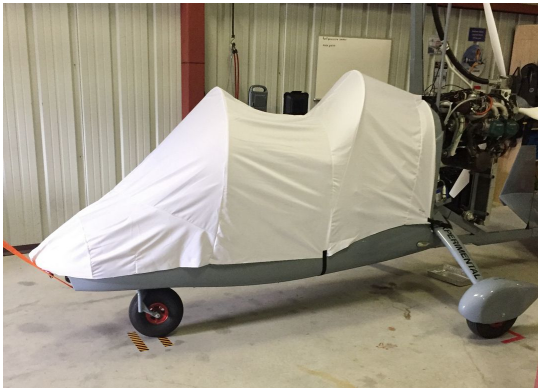
Magni M16 Autogyro Canopy/Nose Cover, test fit cover