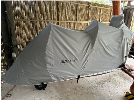
MTO Sport Travel Weight Canopy/Nose Cover

Travel Covers are made with Silver Solution-Dyed Polyester fabric and fully lined over the entire cover. The material is lightweight and more compact for easy stowage in the aircraft. The polyester material is water resistant, but only intended for occasional use outside. We also have an ultra lightweight material available for fitted hangar dust covers. For daily outdoor use, the non-travel Sunbrella Cover is the best choice.