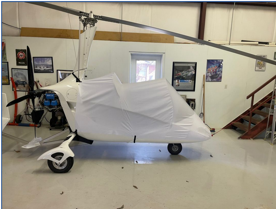
MTO Sport Gyrocopter Canopy/Nose Cover, test fit cover