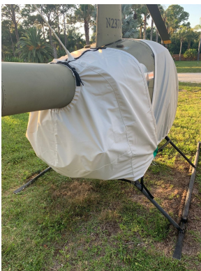
Robinson R-22 Engine Cover

Bruce's Autogyro MTO Sport, 2010, 2017 Gyrocopter Blade Covers are made of medium-weight Solution-Dyed Polyester and designed to avoid trim tabs or wicks. You can install Blade Covers from the ground with the aid of a lightweight rope attached to the open end. Covers are cinched tight at the blade root with straps and quick-release plastic buckles. The Cold Weather Blade Covers are fitted with full-length zippers and optional deice "boots" designed to accept a preheater hose; a small opening at the tip of the cover allows for some air circulation and drainage in freezing weather. Some part numbers have features for an extra charge.