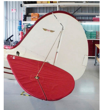
Waco UPF-7 Horizontal Stab. Cover