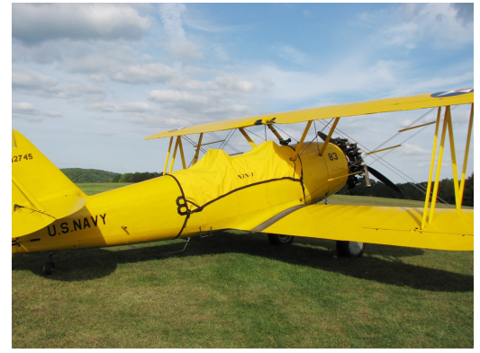
N3N Canopy Cover