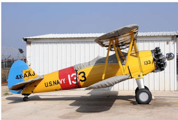
Boeing Stearman PT-13 Canopy, Wing & Horiz. Stab Covers

WINTER USE MATERIAL - Made with Solution-Dyed Polyester fabric, this option is intended for seasonal use to aid in deicing, rain mitigation, or for occasional travel. The material is lighter and more compact, but more susceptible to UV damage and may have a shorter useful life if used continuously outside than the all-year use material.