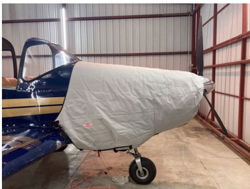
Navion Insulated Engine Cover

This cover type is made from Silver Acrylic Sunbrella canvas and is 100% lined with a soft and smooth microfiber. Bruce's Custom Covers developed this material combination especially for aircraft protection. The outer material is medium weight and treated for water resistance, UV resistance and anti-static buildup. The inner lining is a very soft and smooth microfiber to prevent scratching. The material is very reflective, and tests show that the cabin interior temperature can be reduced to near-ambient temperature on the hottest of days. It is water, ice and snow repellent, yet breathable to allow moisture to escape from between the cover and the aircraft surface.