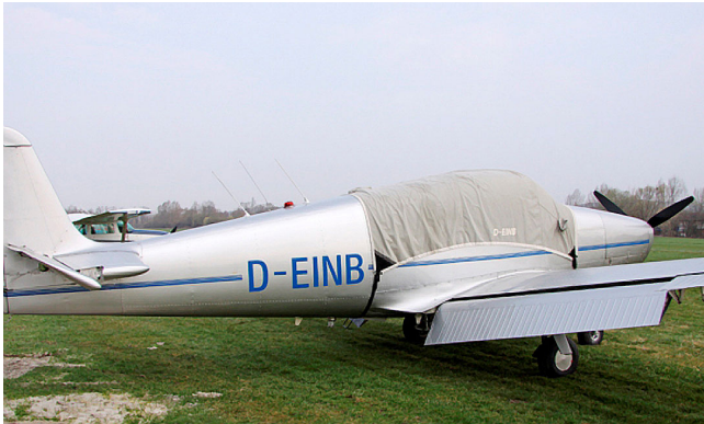
Navion Rangemaster Canopy Cover

This cover type is made from Silver Acrylic Sunbrella canvas and is 100% lined with a soft and smooth microfiber. Bruce's Custom Covers developed this material combination especially for aircraft protection. The outer material is medium weight and treated for water resistance, UV resistance and anti-static buildup. The inner lining is a very soft and smooth microfiber to prevent scratching. The material is very reflective, and tests show that the cabin interior temperature can be reduced to near-ambient temperature on the hottest of days. It is water, ice and snow repellent, yet breathable to allow moisture to escape from between the cover and the aircraft surface.