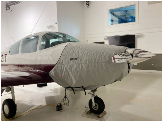
NAVION H Insulated Engine Cover

This cover type is made from Silver Acrylic Sunbrella canvas and is 100% lined with a soft and smooth microfiber. Bruce's Custom Covers developed this material combination especially for aircraft protection. The outer material is medium weight and treated for water resistance, UV resistance and anti-static buildup. The inner lining is a very soft and smooth microfiber to prevent scratching. The material is very reflective, and tests show that the cabin interior temperature can be reduced to near-ambient temperature on the hottest of days. It is water, ice and snow repellent, yet breathable to allow moisture to escape from between the cover and the aircraft surface.