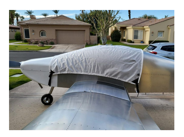
Sonex OneX Canopy Cover