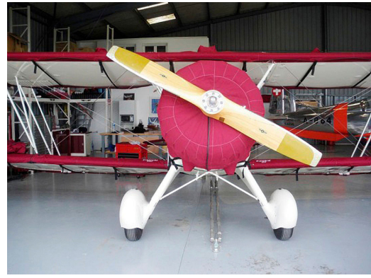
Waco UPF-7 Engine Cover