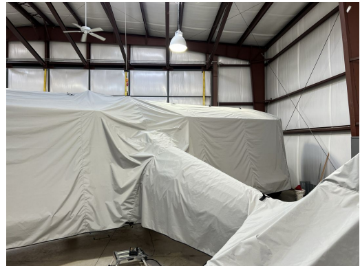
Stearman PT-13 Full Body Dust Cover, Prop Cover Included