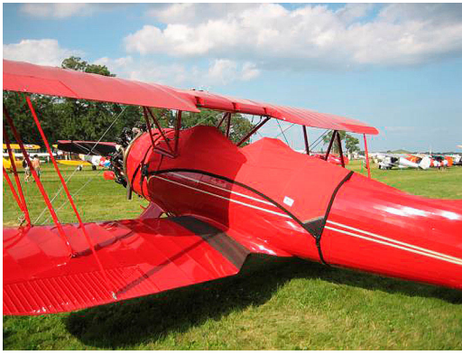
Waco UPF7 Canopy Cover