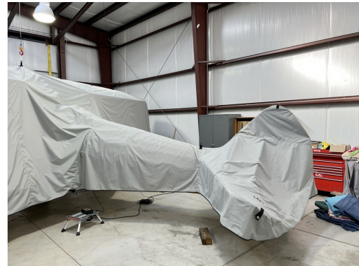
Stearman PT-13 Full Body Dust Cover, Prop Cover Included