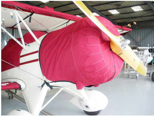
Waco UPF-7 Engine Cover