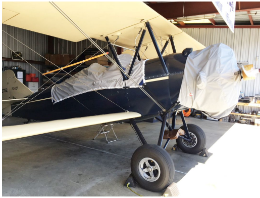
Travel Air 4000 Canopy and Engine Covers, light weight travel type