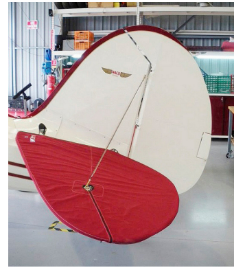
Waco UPF-7 Horizontal Stab. Cover