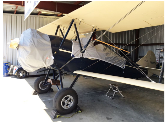
Travel Air 4000 Canopy and Engine Covers, light weight travel type