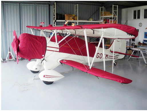
Waco UPF-7 Canopy, Wings, Stab's, Engine, Prop Covers