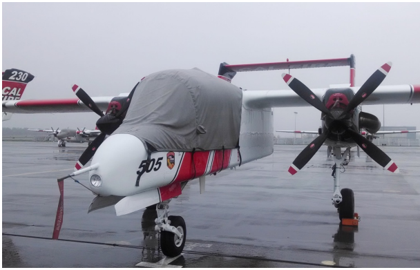
Rockwell OV-10 Canopy Cover