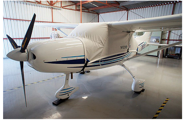
TL Ultralight Sirius Canopy Cover