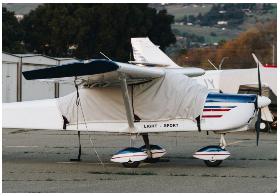
Paradise P-1 Canopy Cover

the hottest of days. It is water, ice and snow repellent, yet breathable to allow moisture to escape from between the cover and the aircraft surface.