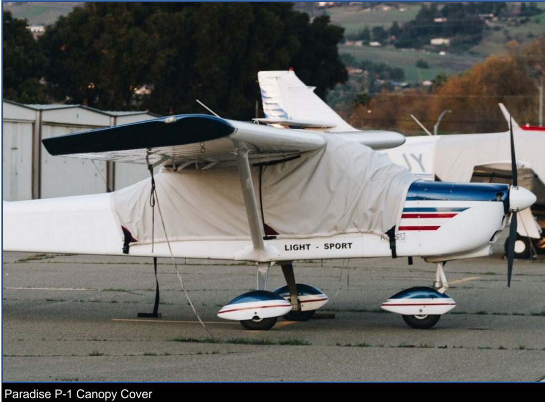
Paradise P-1 Canopy Cover