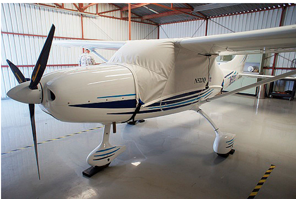
TL Ultralight Sirius Canopy Cover