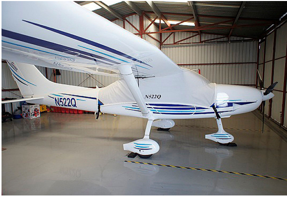
TL Ultralight Sirius Canopy Cover

the hottest of days. It is water, ice and snow repellent, yet breathable to allow moisture to escape from between the cover and the aircraft surface.