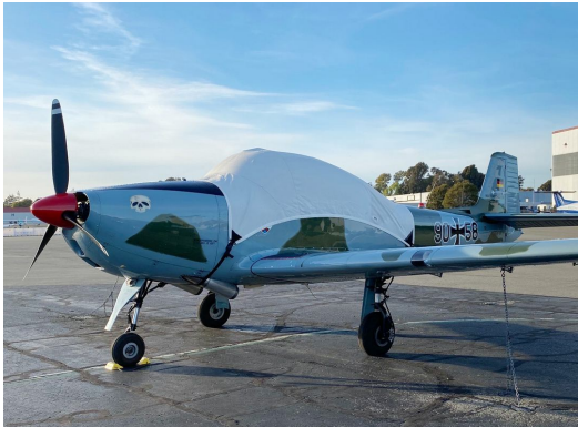
Focke Wulf 149 Trainer Canopy Cover

Cover and Engine Cover. This cover will enclose the engine cowl and will extend aft to cover all of the windows. This cover type is made from Silver Acrylic Sunbrella canvas and is 100% lined with a soft and smooth microfiber. Bruce's Custom Covers developed this material combination especially for aircraft protection. The outer material is medium weight and treated for water resistance, UV resistance and anti-static buildup. The inner lining is a very soft and smooth microfiber to prevent scratching. The material is very reflective, and tests show that the cabin interior temperature can be reduced to near-ambient temperature on the hottest of days. It is water, ice and snow repellent, yet breathable to allow moisture to escape from between the cover and the aircraft surface.