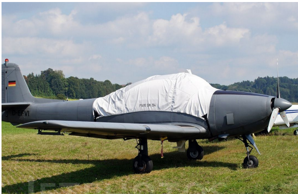
Piaggio P-149 Canopy Cover