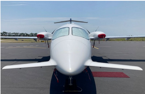
Piaggio P180 Cockpit HeatShields,

Cockpit Heatshields are interior sunshades for the aircraft's cockpit. The product is a unique composite of closed-cell foam with a silver mylar finish. The semi-rigid design is stiff enough to stand inside the window framing. The set folds up flat and is easily stored in the included storage sleeve. Some designs may require velcro and suction cups. A Heatshield is an excellent short-term remedy for cockpit overheating, but an external fabric cover is more effective for long-term protection.