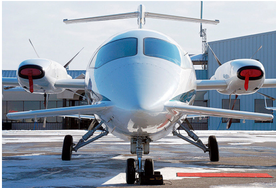
Piaggio 180 Engine Plugs

Engine Inlet Plugs are custom fit for your Piaggio Avanti P180 intakes, made with heavy-duty vinyl material, and stuffed with a single block of sculpted urethane foam. Each plug has a zipper that allows the foam to be removed and dried if necessary. Engine plugs have warning flags that are visible from the cockpit or 'remove before flight' streamers sewn onto the face of the plugs. Most plugs are imprinted with the aircraft registration number in black for an extra charge. Storage bag NOT included. Engine plugs may be inserted after flight when the engine is still warm. Engine Inlet Plugs are commonly referred to as Cowl Plugs, Intake Plugs, Cowl Blocks, Engine Blocks, and Engine Bungs.