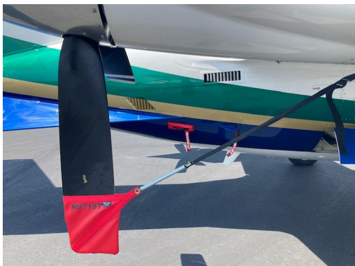
Piaggio P180 Prop Ties

This cover type is made from Silver Acrylic Sunbrella canvas and is 100% lined with a soft and smooth microfiber. Bruce's Custom Covers developed this material combination especially for aircraft protection. The outer material is medium weight and treated for water resistance, UV resistance and anti-static buildup. The inner lining is a very soft and smooth microfiber to prevent scratching. The material is very reflective, and tests show that the cabin interior temperature can be reduced to near-ambient temperature on the hottest of days. It is water, ice and snow repellent, yet breathable to allow moisture to escape from between the cover and the aircraft surface.