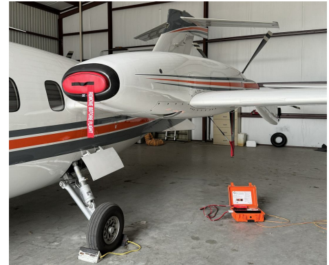
Piaggio P180 Engine Inlet Plugs