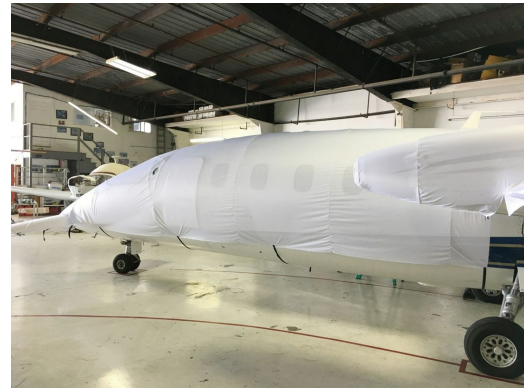
Piaggio P180 Fuselage/Canard Cover & Wing/Engine Covers (test fit covers) Piaggio P180 Fuselage/Canard Cover & Wing/Engine Covers (test fit covers)